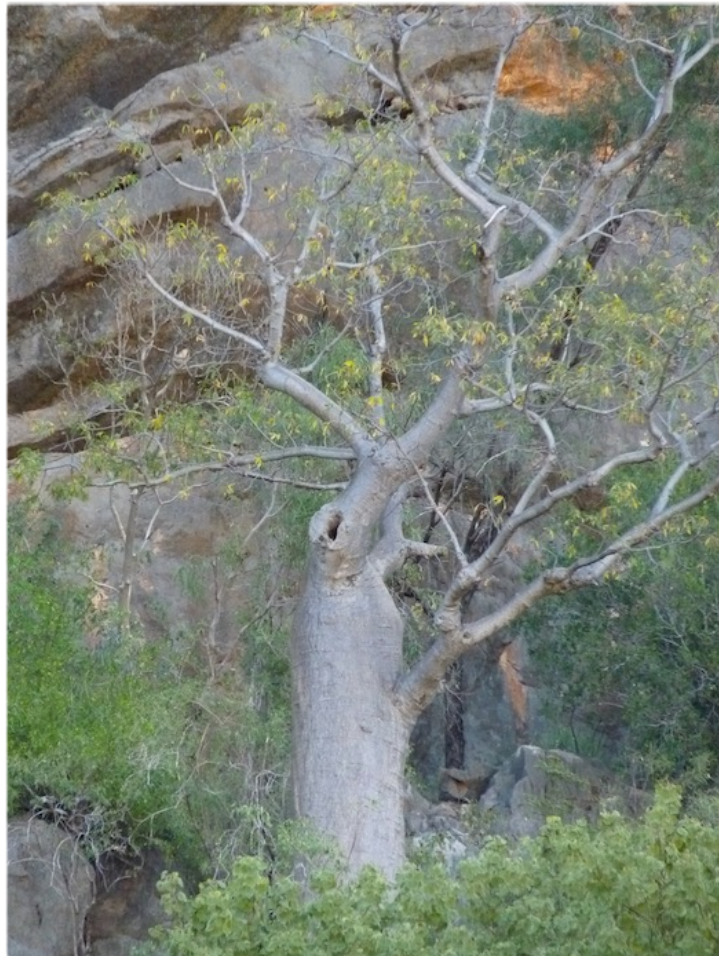
NO KIMBERLEYS ARTICLE IS COMPLETE WITHOUT A BOAB TREE...