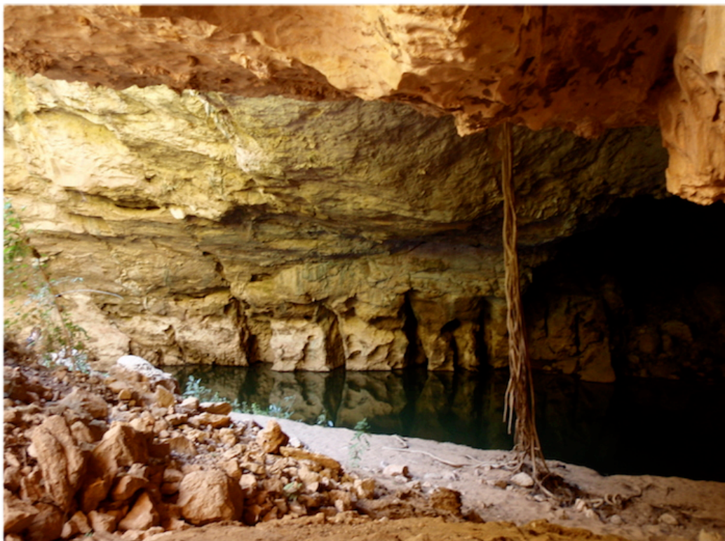
SUCH A RICH COMBINATION OF COLOURS. NOTE THE TREE ROOTS THAT HAVE PENETRATED THE ROOF.