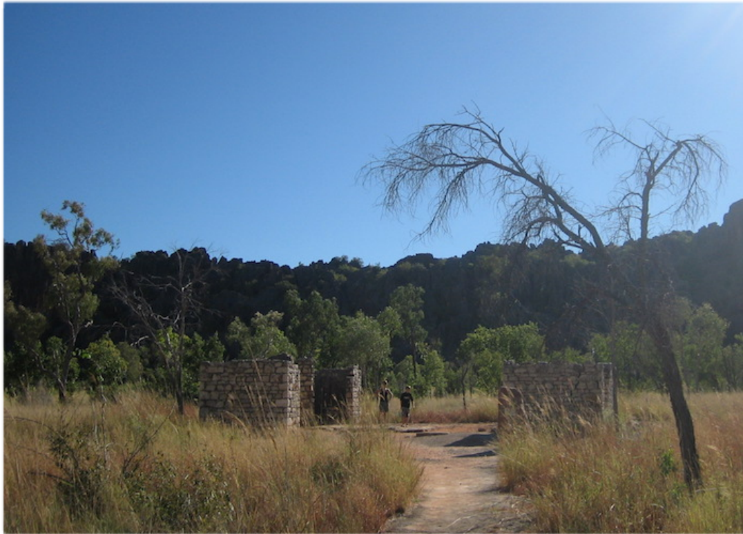
THE REMAINS OF LILLIMULURA POLICE OUTPOST.