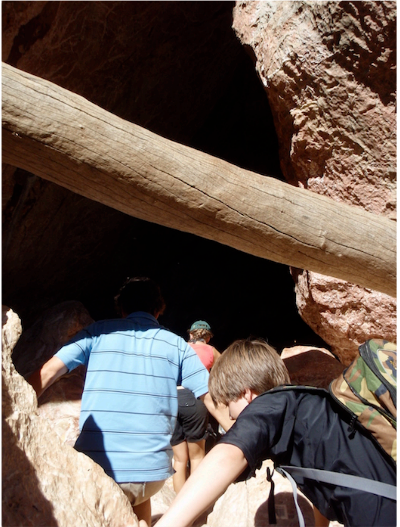
CLAMBERING DOWN INTO TUNNEL CREEK.