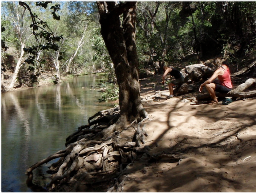
PERFECT SPOT TO COOL OFF.