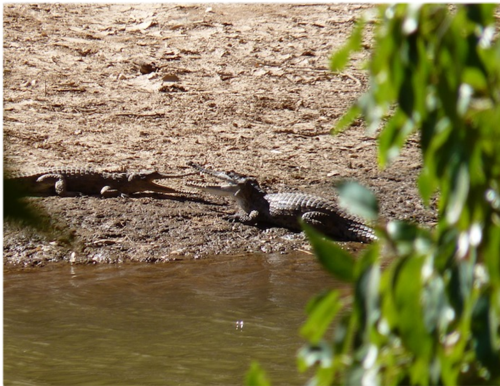
WE FOLLOWED THE WALKING TRACK, THEN SUDDENLY THERE THEY WERE - LOTS OF FRESHWATER CROCODILES SUNNING THEMSELVES IN THE LENNARD RIVER.

First stop was Windjana Gorge. The Lennard River has cut through the Napier mountain range to form a spectacular gorge. This is a great spot for viewing freshwater crocodiles. They just love lazing in the warm pools and sunning themselves on the muddy banks.