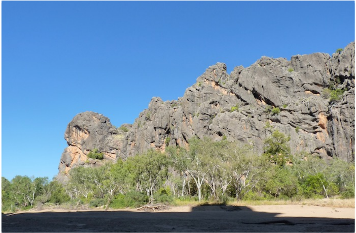
RIPPLES AND LINES GIVE THE APPEARANCE OF OLD AGE.