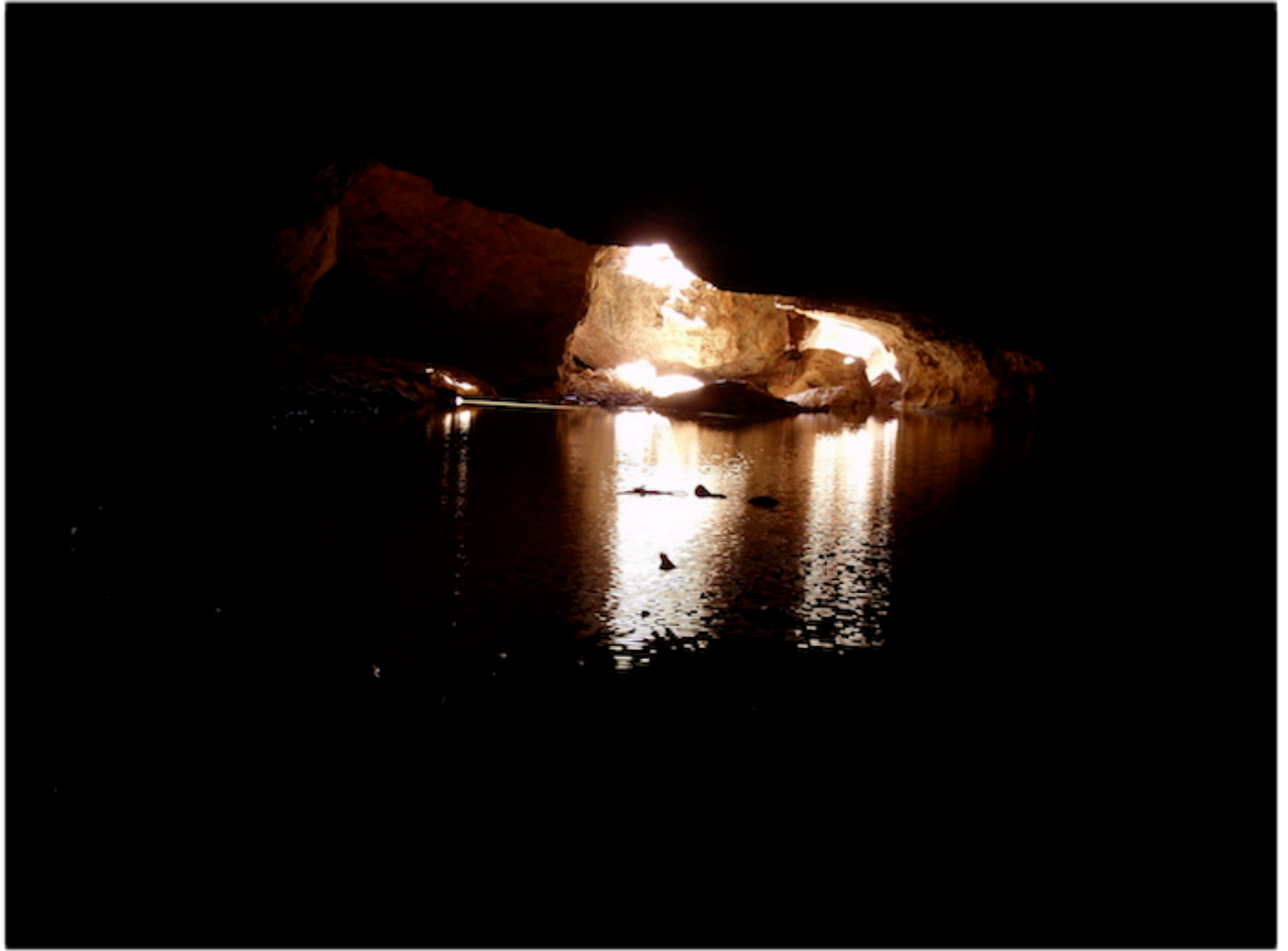
THE PERFECT HIDEOUT.

Tunnel Creek was Jandamarra's hideout and the place where he was eventually shot . Would have made a great hideout - concealed entrance, pitch black caves, lots of little nooks and crannies inside and a few secret exits where the roof has collapsed.