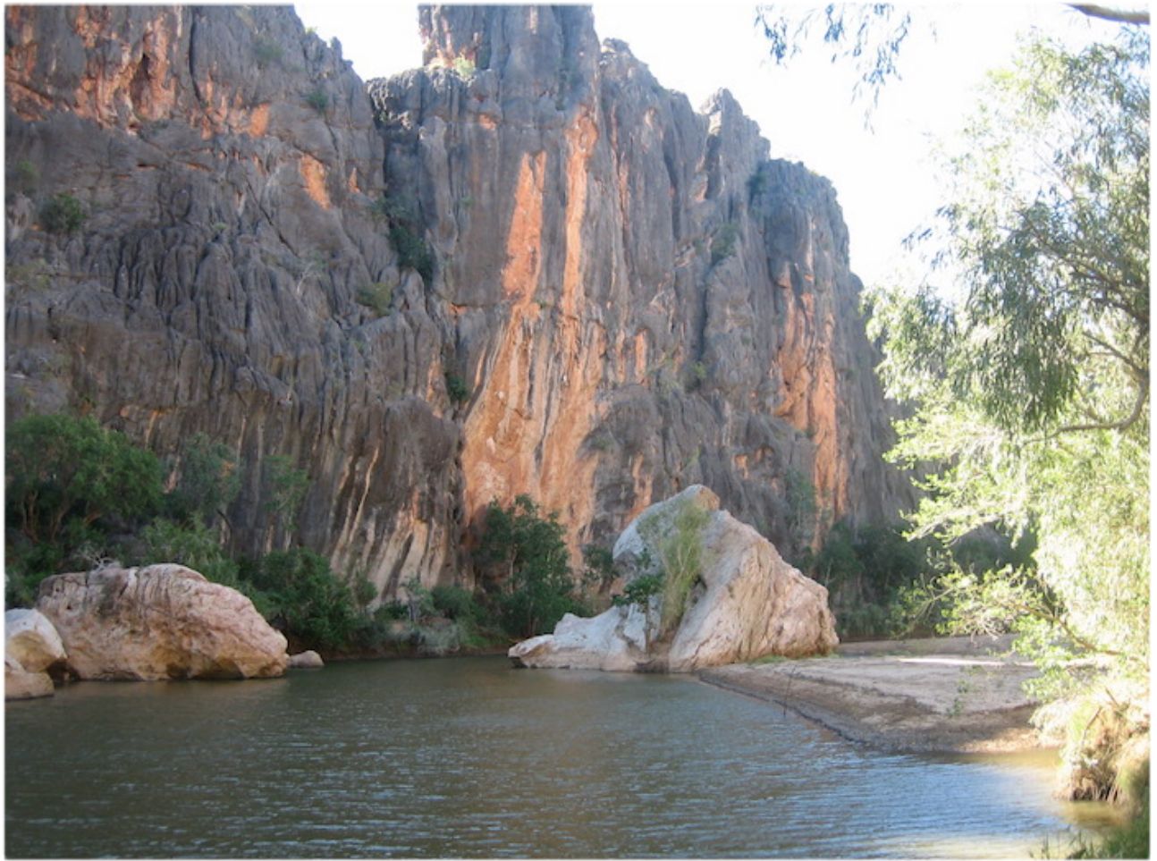
THE DELIGHTFUL WINDJANA GORGE.

Consequently, the campground is unique - and quite beautiful. Watching the sun rise over an ancient coral reef is not something you’ll experience every day!