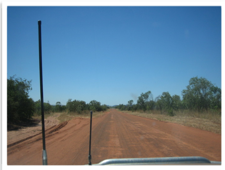
LOTS OF DIRT ON THE GRR.

First stop was Windjana Gorge. The Lennard River has cut through the Napier mountain range to form a spectacular gorge. This is a great spot for viewing freshwater crocodiles. They just love lazing in the warm pools and sunning themselves on the muddy banks.