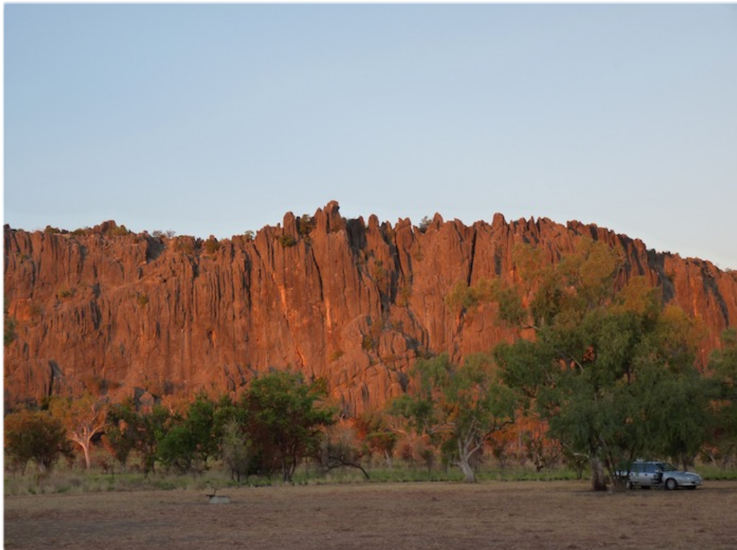
LATE AFTERNOON LIGHT TRANSFORMS THE CLIFFS. THINK I COULD GET USED TO THIS VIEW!