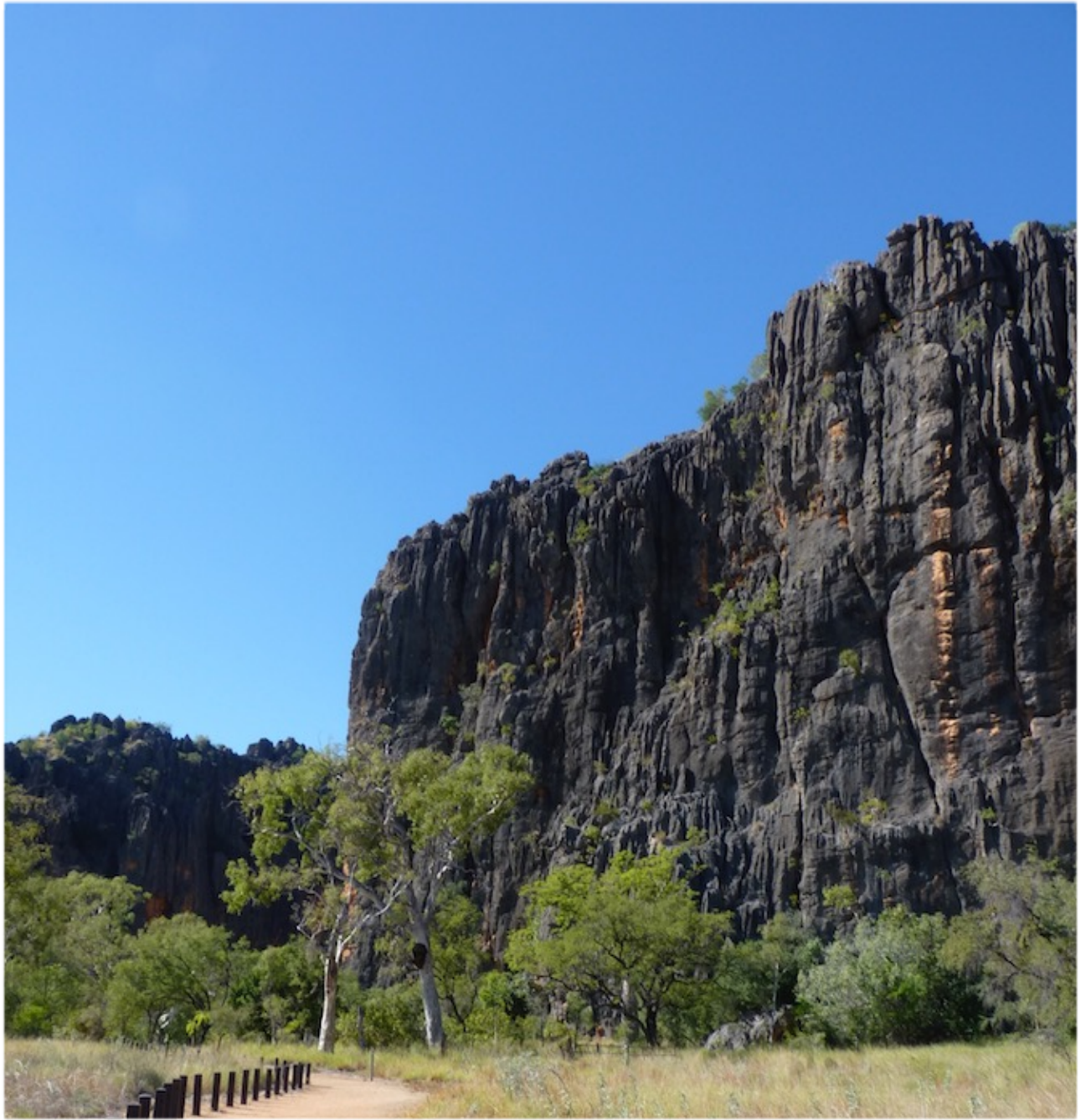
IMPOSING CLIFF FACES EVERYWHERE YOU LOOK.