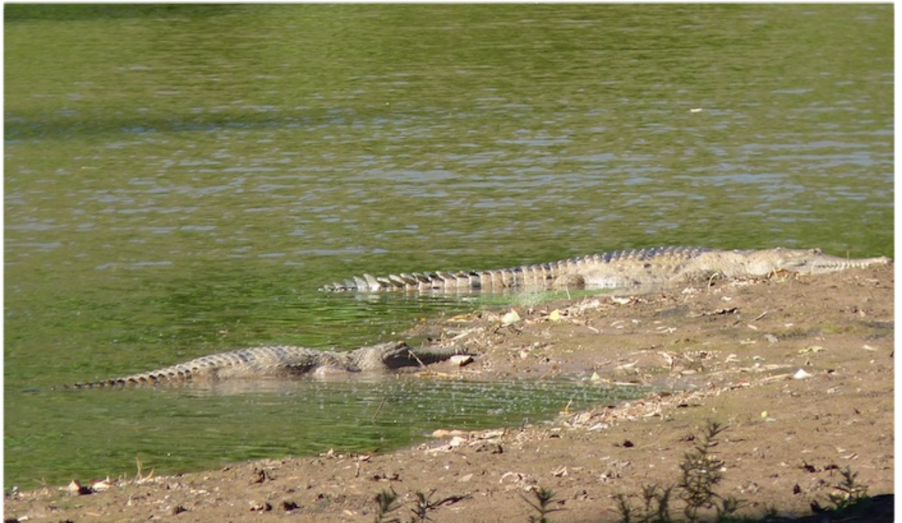
TIME FOR A NAP AND SOME SUN BAKING.