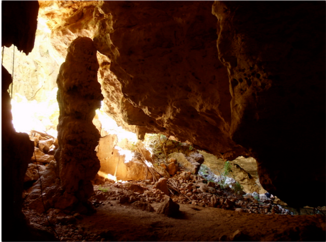
THE LIGHTSHOW INSIDE TUNNEL CREEK WAS SOMETHING ELSE.