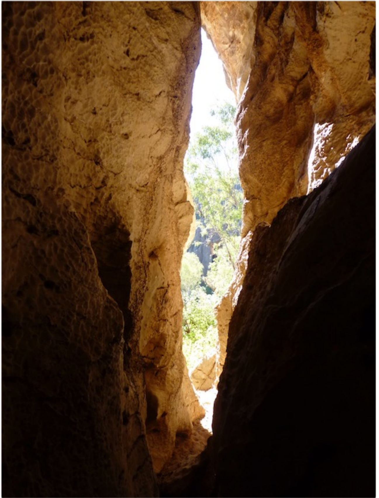
NAPIER RANGE IS FULL OF CRACKS AND CREVICES.