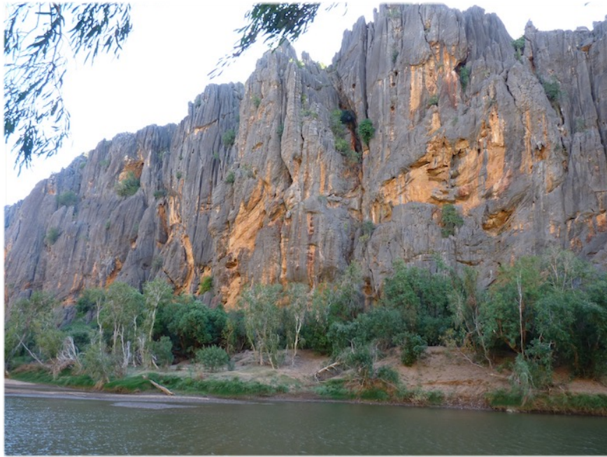
STRANGE COLOURING IN THE LIMESTONE CLIFFS.