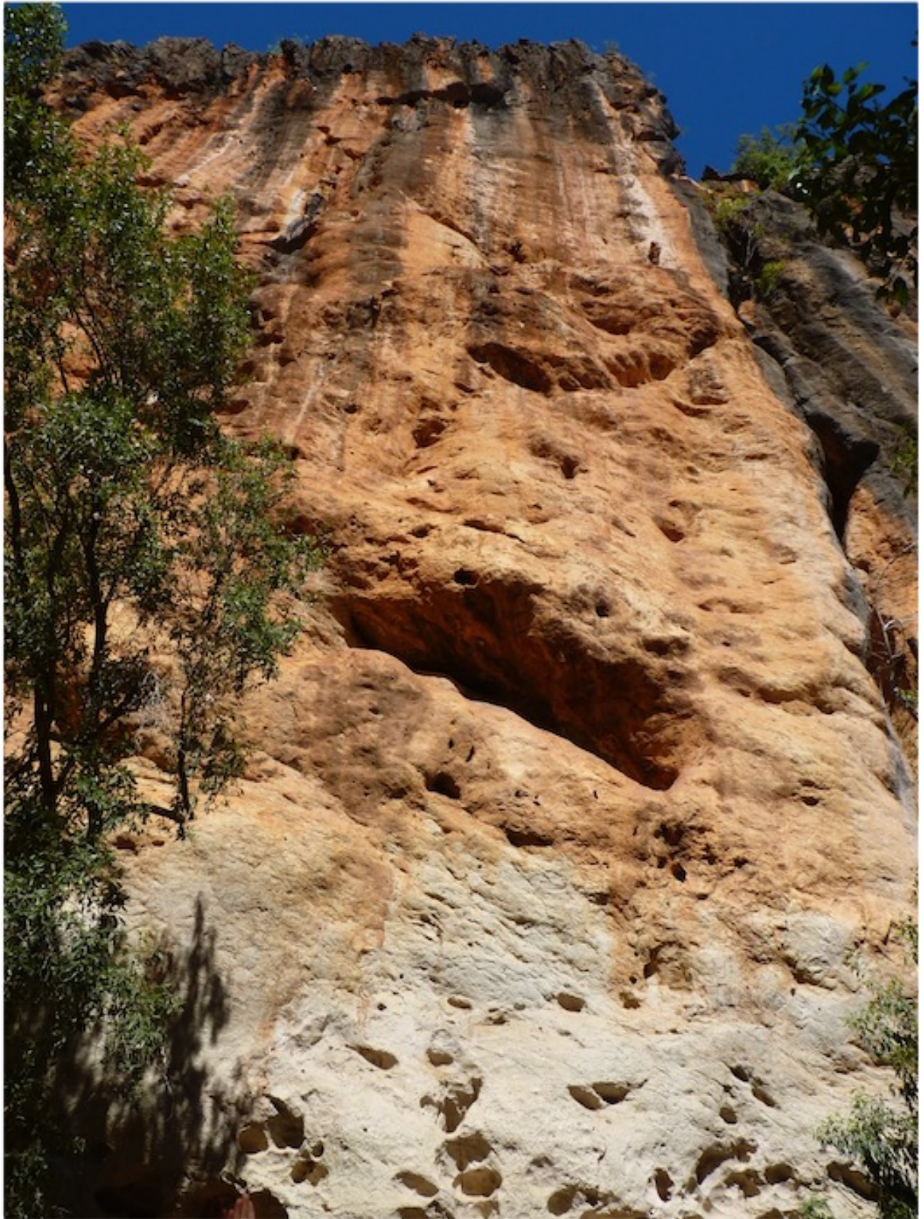
HARD TO BELIEVE THIS WAS BUILT BY TINY SEA CREATURES 350 MILLION YEARS AGO.