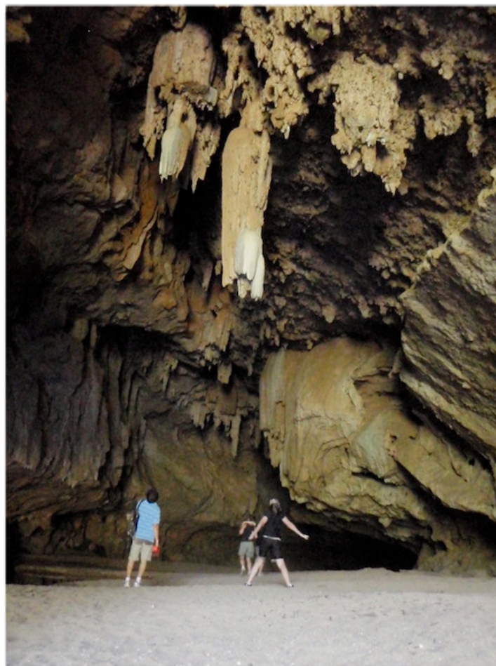
GIANT STALACTITES IN THE CAVES.