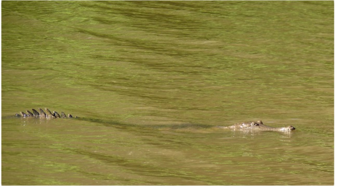
A FRESHIE DOING ITS BEST LOG IMPERSONATION.