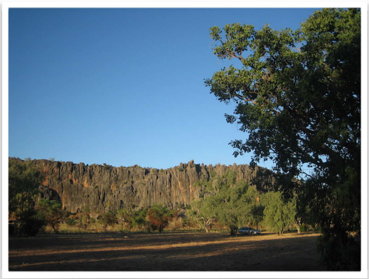
THE NAPIER RANGE IS EXTRAORDINARY. SUCH A BEAUTIFUL CAMPSITE.