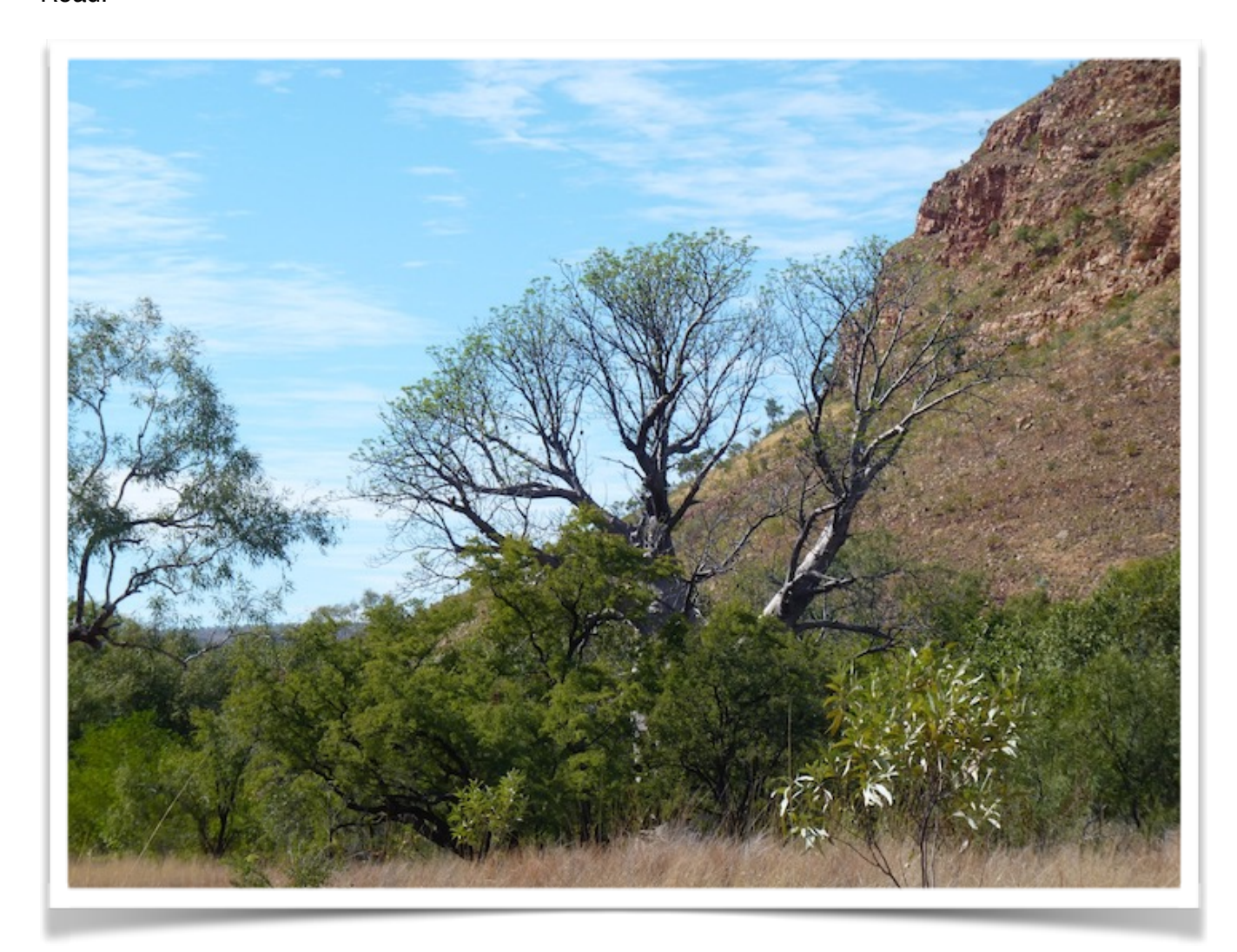
A CLASSIC KIMBERLEYS SCENE - A FRUITING BOAB TREE AGAINST AN ANCIENT ROCKY CLIFF.

Mornington's landscape is certainly more arid than land further north. Open savannah country dominates. This land is clearly more arid than the sub-tropical landscape along the Gibb River Road.