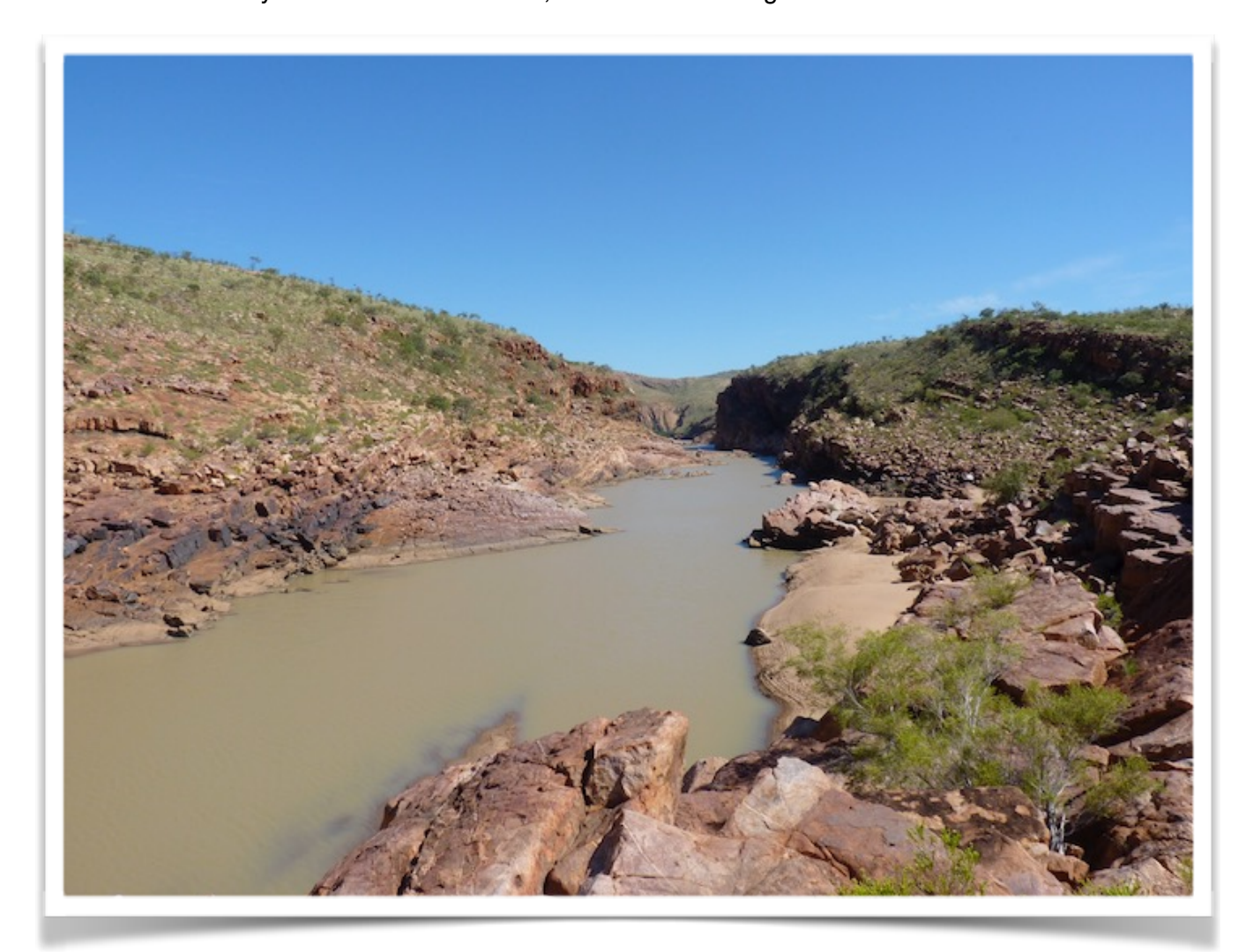
THE FITZROY RIVER AT DIMOND GORGE.

The Fitzroy River flows through Mornington Wildlife Sanctuary. Over many millions of years the Fitzroy has formed Dimond Gorge. In the 1950s a crazy plan was hatched to dam Dimond Gorge. It was to supply Perth with water, which would be about 2,500km away! Then in 1990 there was another proposal to dam Dimond Gorge - this time to provide irrigation for proposed cotton farms to the south. Thankfully neither came to fruition, as most of Mornington would have been under water.