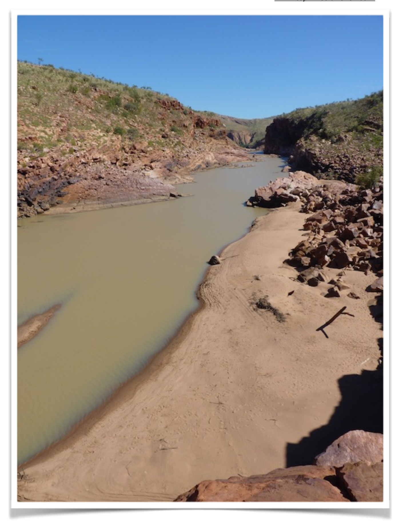
IMAGINE THIS GORGE COMPLETELY FULL IN THE 2002 FLOOD - THAT'S A HUGE VOLUME OF WATER.