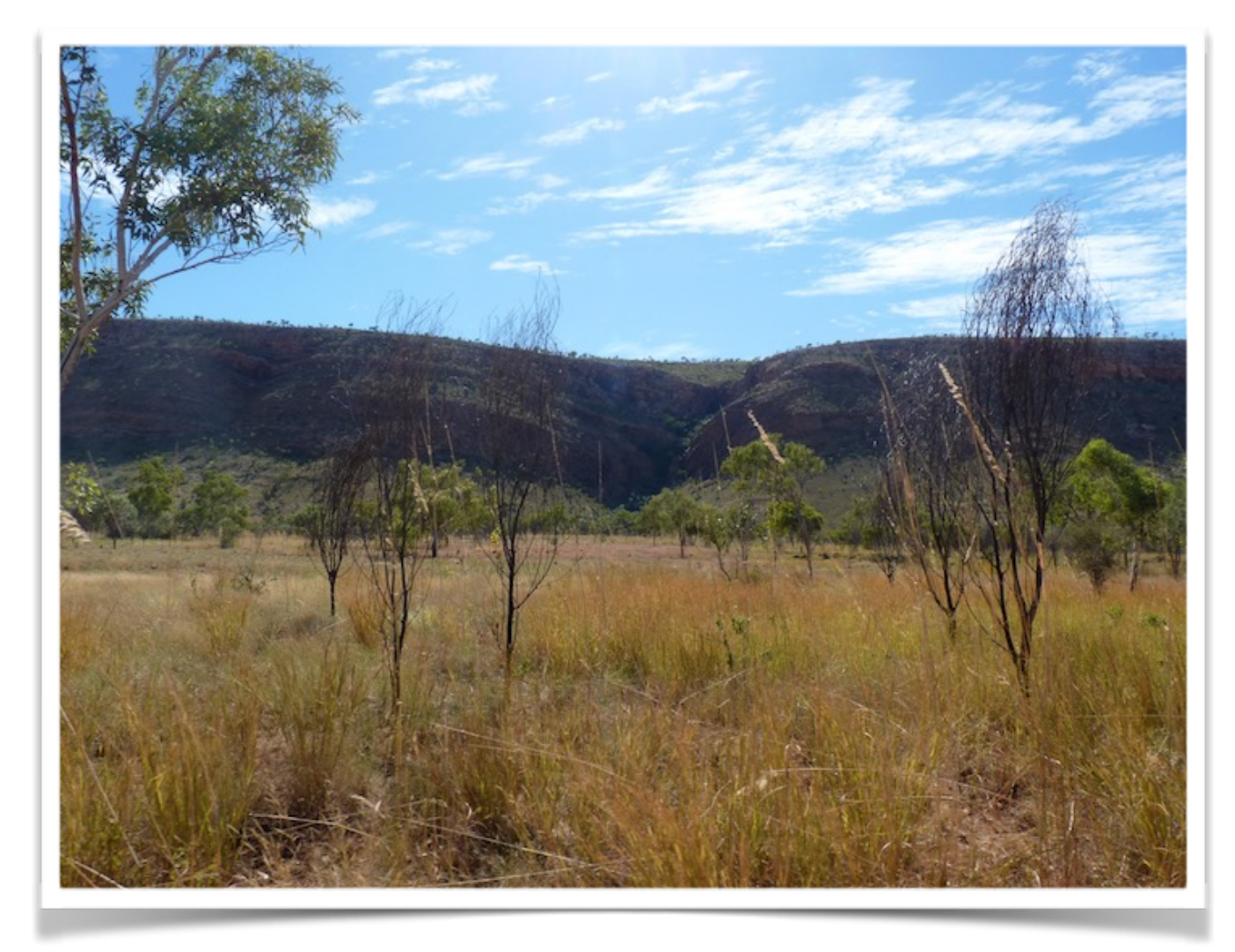
THERE'S A SURPRISE IN THAT GULLY YOU CAN SEE IN THE DISTANCE...