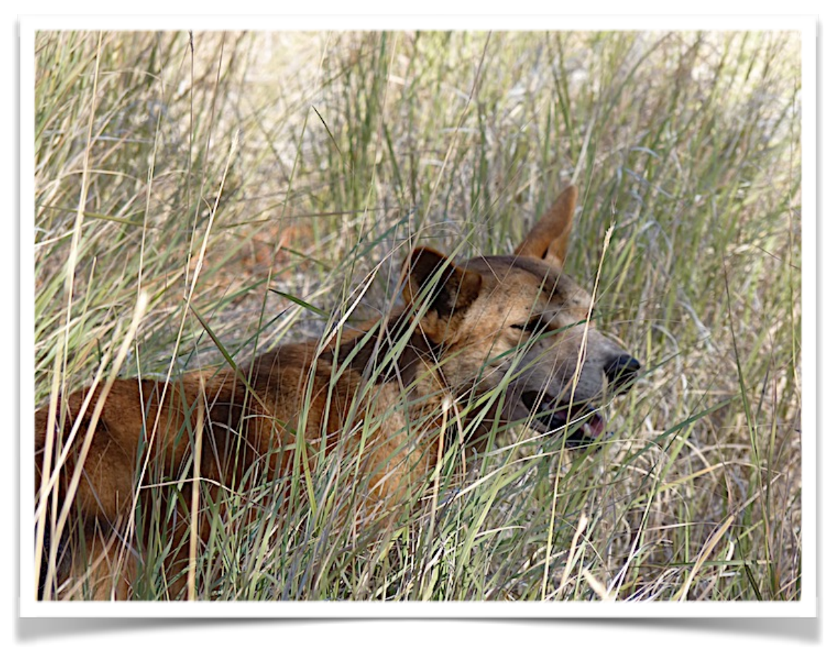
WE CAN STILL SEE YOU...