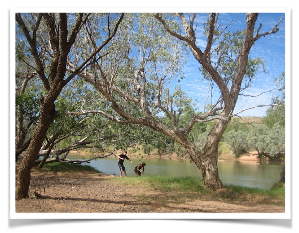
SKIMMING STONES AT CADJEBUT. THERE WAS NO SHORTAGE OF STONES!