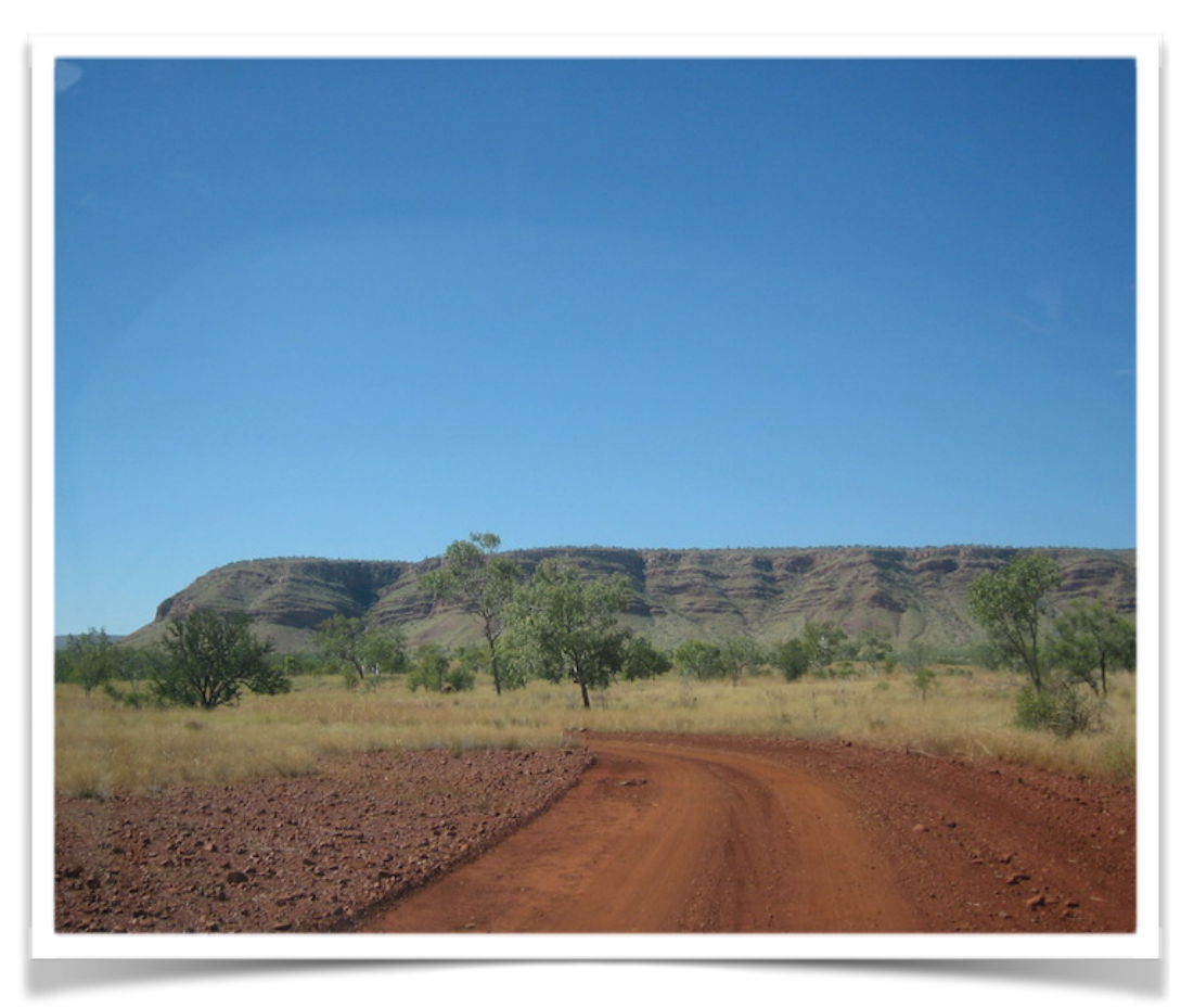
TYPICAL LANDSCAPE AT MORNINGTON - VAST SAVANNAH PLAINS, WITH KING LEOPOLD RANGE IN THE DISTANCE.

It's a wildlife sanctuary, privately owned and managed by the Australian Wildlife Conservancy (AWC). AWC was established to reverse Australia's extremely high rates of flora and fauna extinction.