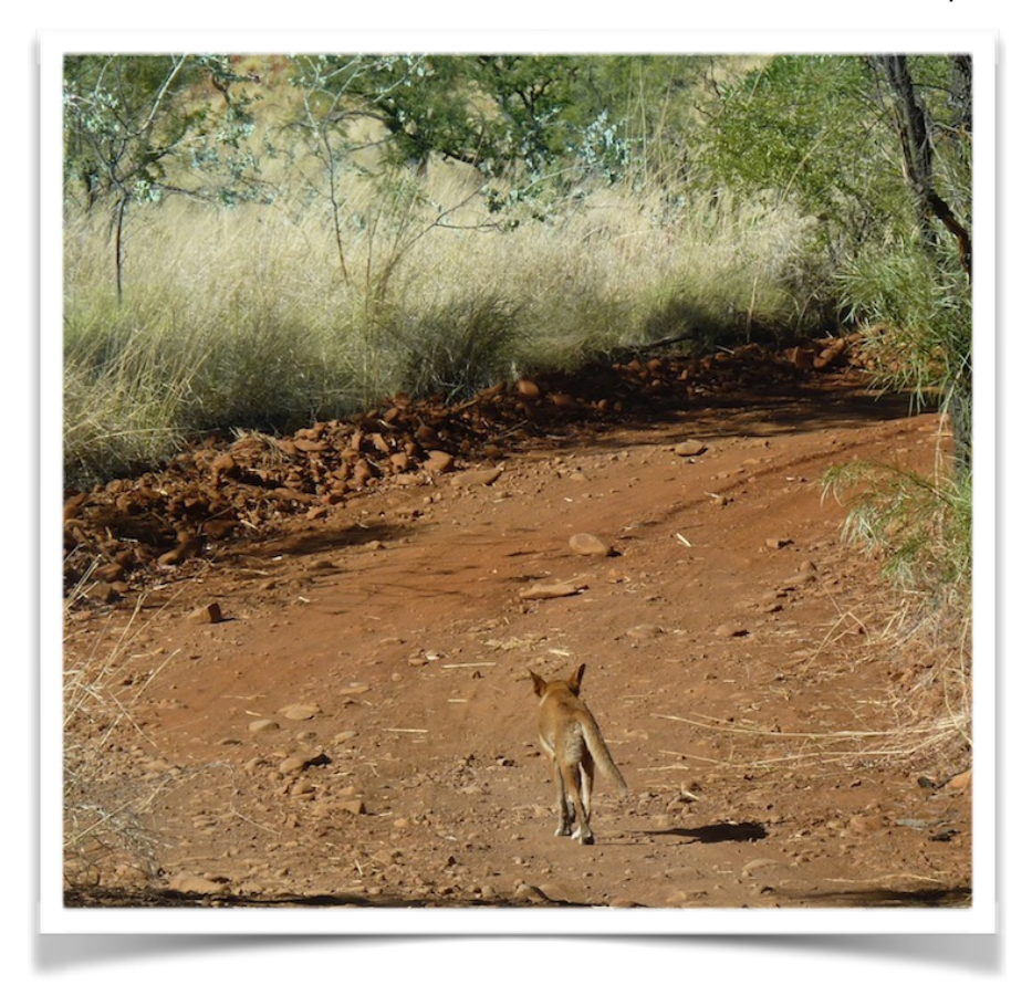
A DINGO TROTTING ALONG THE TRACK TO DIMOND GORGE.