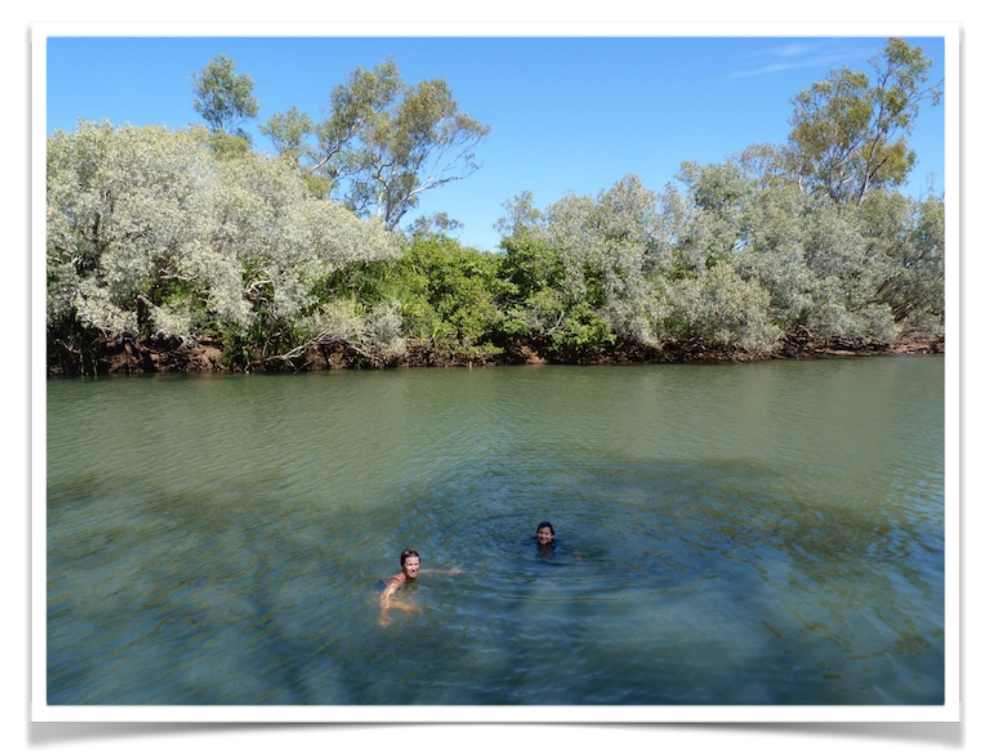
SWIMMING AT BLUE BUSH POOL.

To be honest, we were a little disappointed with the Fitzroy. Given we were there in May, we all expected to see more water in the river. I suppose it has a lot to do with the sandy soil - the water just doesn't stay on the surface. Must be amazing to see in the Wet though.