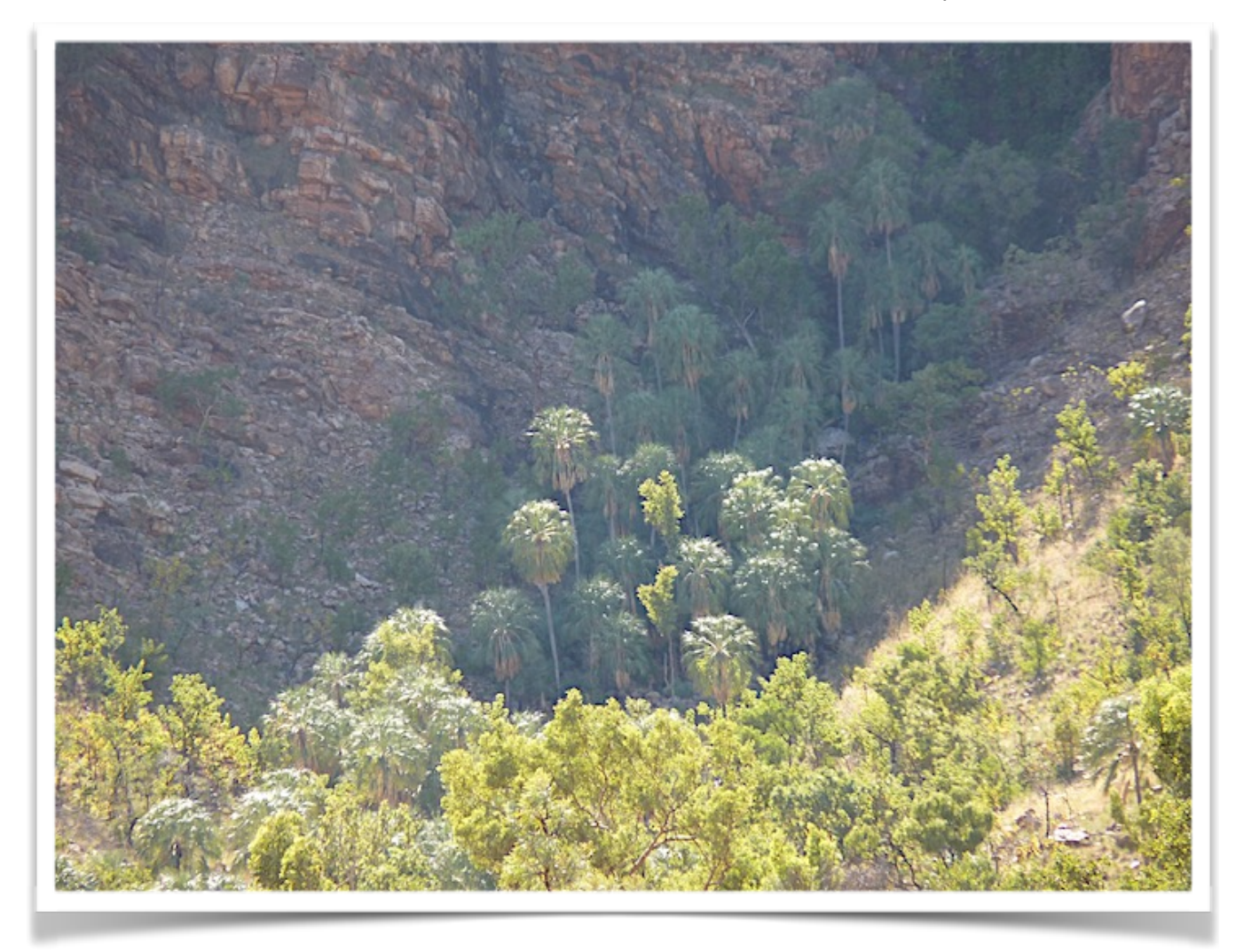
LIVISTONIA PALMS ARE THRIVING HERE. WE DIDN'T EXPECT THIS!

You can get an appreciation for this landscape by taking a rocky track from Mornington Wilderness Camp to Dimond Gorge and the Fitzroy River. It vaguely follows the base of King Leopold Range and the views are at times simply stunning.