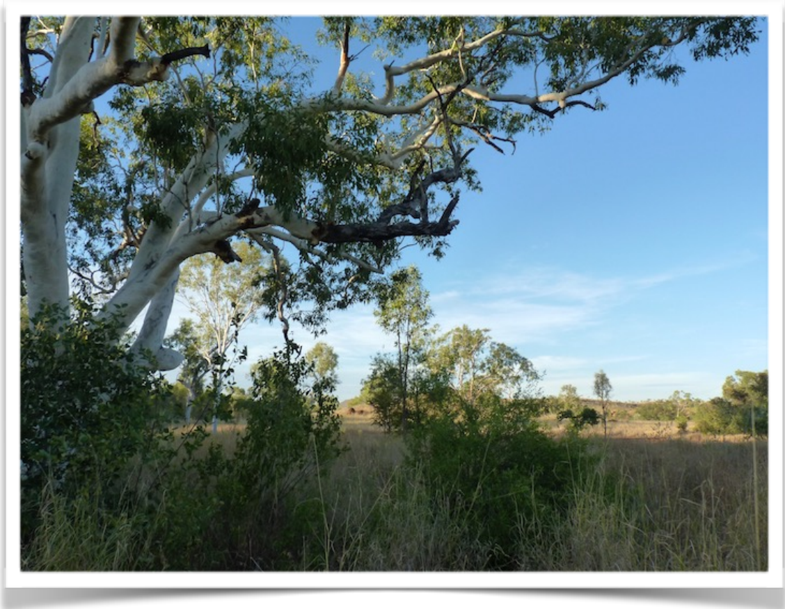
LOOKING SOUTH FROM ANNIE CREEK. COMPARED TO FURTHER NORTH, THIS COUNTRY IS QUITE DRY.