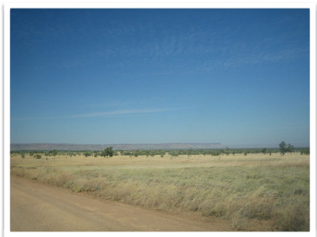
KING LEOPOLD RANGES IN THE DISTANCE, ACROSS THE VAST PLAINS.