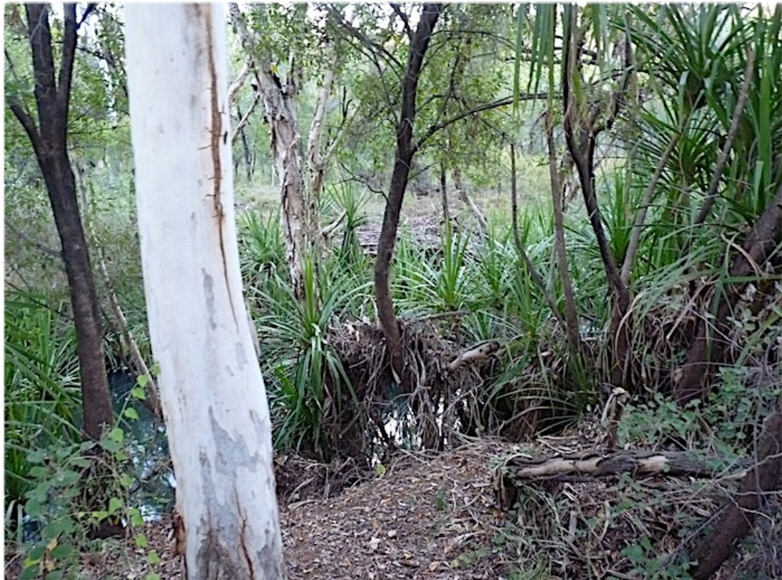
ANNIE CREEK. LOVE THOSE PANDANUS PALMS.