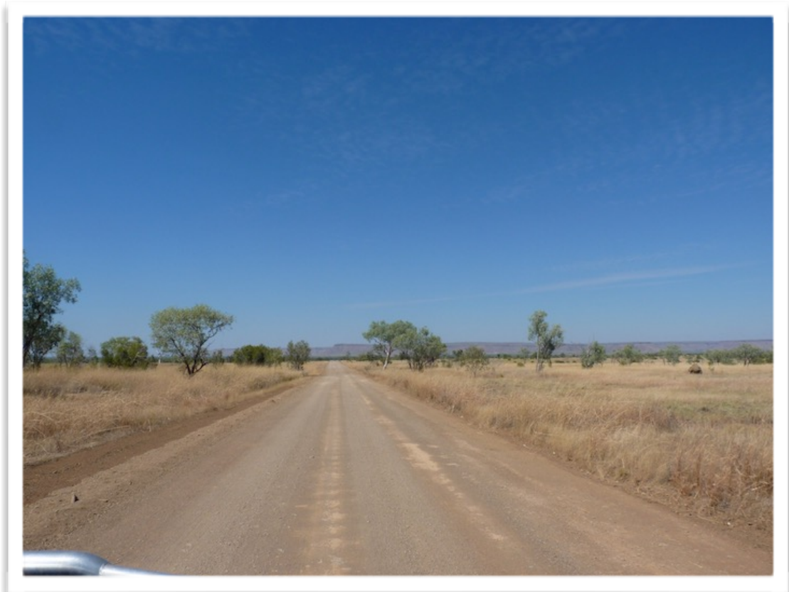
ON THE ROAD TO MORNINGTON WILDERNESS CAMP. KING LEOPOLD RANGES ARE IN THE DISTANCE.