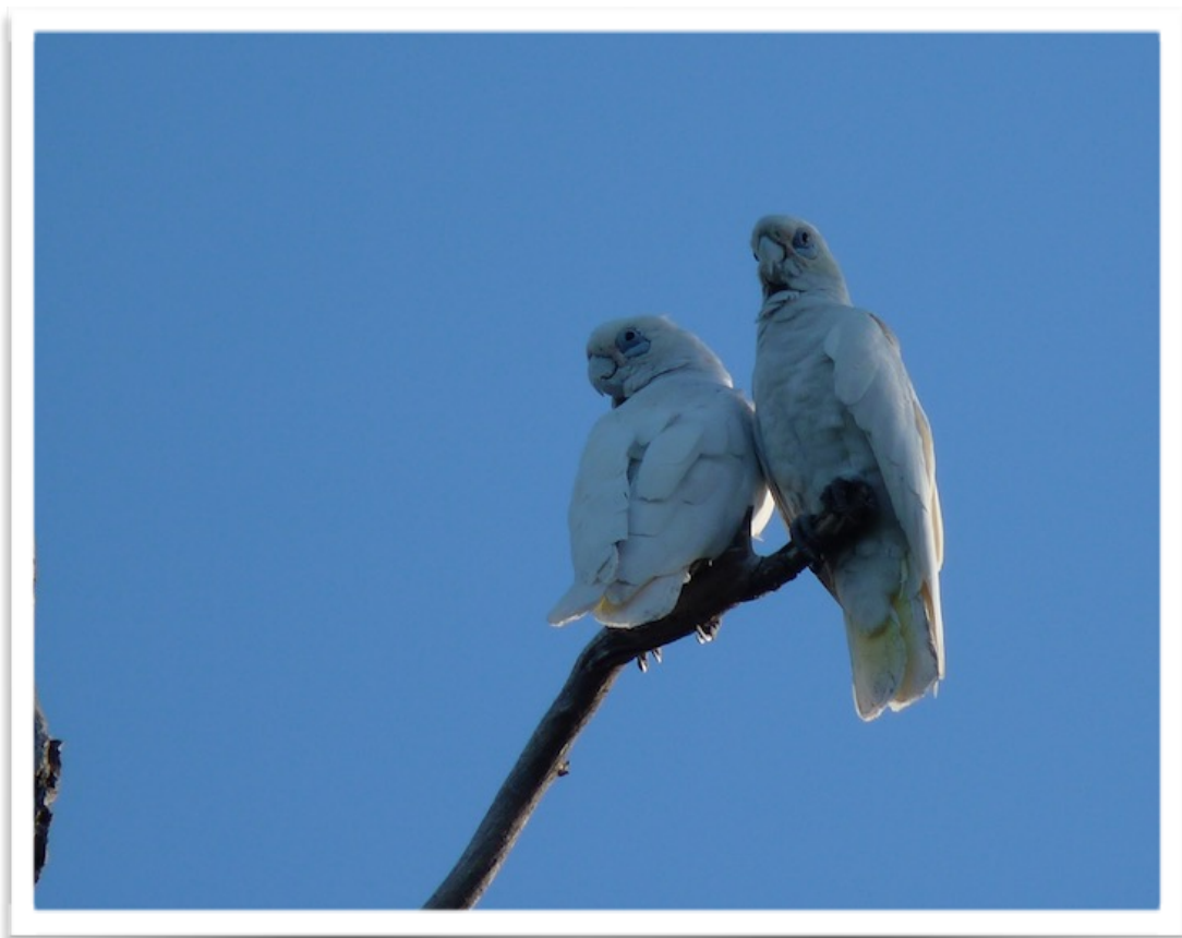
A PAIR OF CORELLAS TAKING IN THE VIEW.