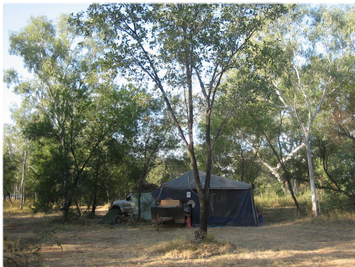
COOL AND SHADY CAMPSITE AT MORNINGTON WILDERNESS CAMP.

Mornington Wilderness Camp is a great spot for campers - plenty of shade, flushing toilets and hot showers. It is expensive though. You might want to check out the prices before driving all the way in there. Although remember the place is run by Australian Wildlife Conservancy, a non-profit organisation. So your camp fees are really a donation to a good cause.