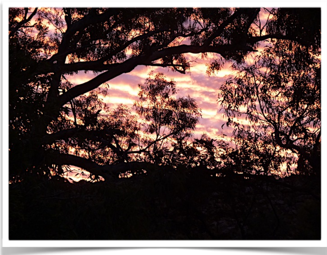
YET ANOTHER MAGNIFICENT OUTBACK SUNSET.