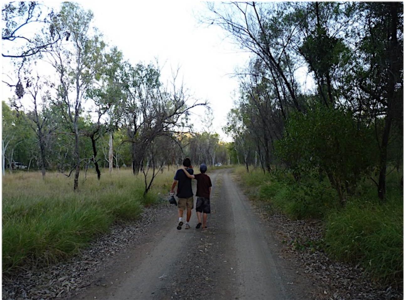
WALKING BACK TO CAMP.

The campsite backs onto Annie Creek and the whole area was rich with birds. A birdwatcher's paradise! An easy walk along the creek is an opportune time to stretch your legs and see some of these beautiful birds up close.