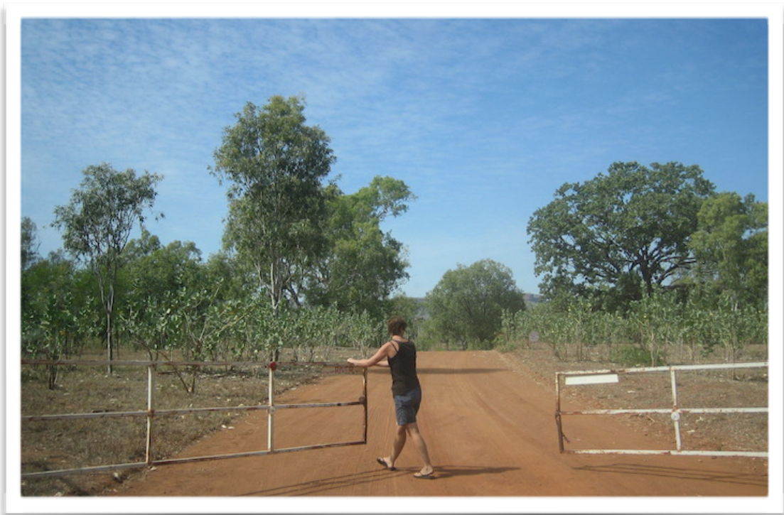
OUR RESIDENT GATE-OPENER DOING A GREAT JOB!

Mornington is about 90km south-east once you turn off the GRR. Generally the road was pretty good, with a few gates and lots of dips. The last 20km or so deteriorates into a rocky track, but nothing too taxing.