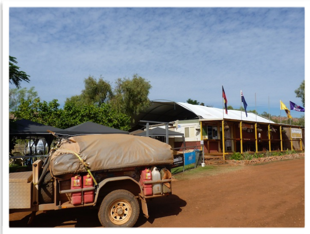
OUR DUSTY CAMPER TRAILER OUTSIDE IMINTJI ROADHOUSE.