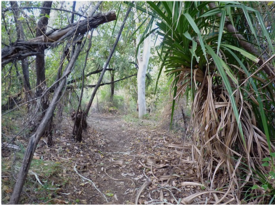
THE WALKING TRACK ALONG ANNIE CREEK WINDS AMONGST THE FOLIAGE.