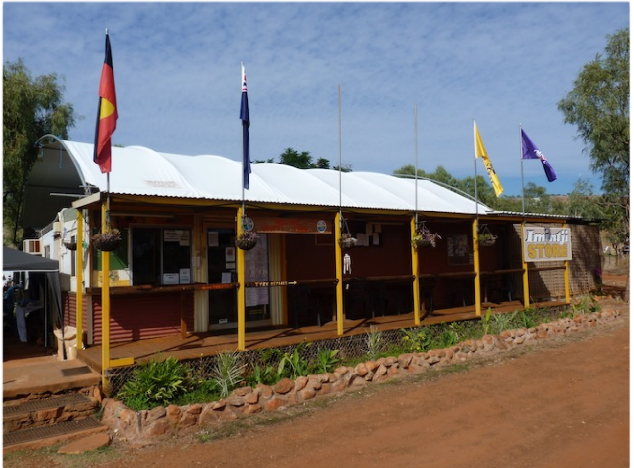
IMINTJI ROADHOUSE ON THE GIBB RIVER ROAD.

On the way we called into Imintji Roadhouse on the Gibb River Road (GRR). It's a neat and tidy place, but only sells diesel - a trap for the unwary. Since we last visited, Imintji closed down for a while but has since re-opened. You can also buy basic supplies.