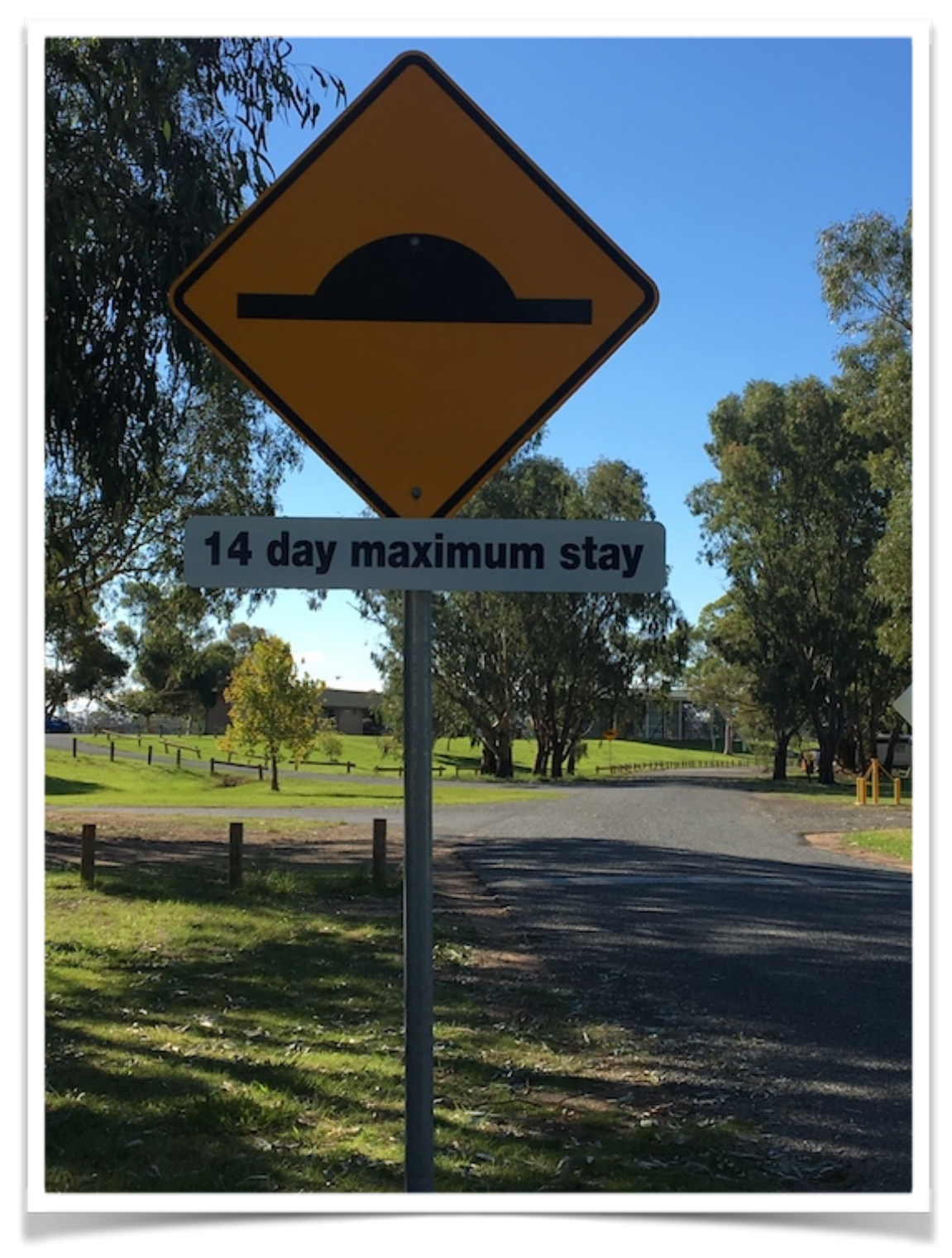
YEP, IT'S STILL A 14 DAY STAY!

On the last point, we were having a yarn to the caretaker, he's a real character. Recently (April 2017) there's been mis-information about how long you can stay for. A rumour spread that the maximum stay was now 3 days. This is completely wrong - it's still 14 days and it's not changing.