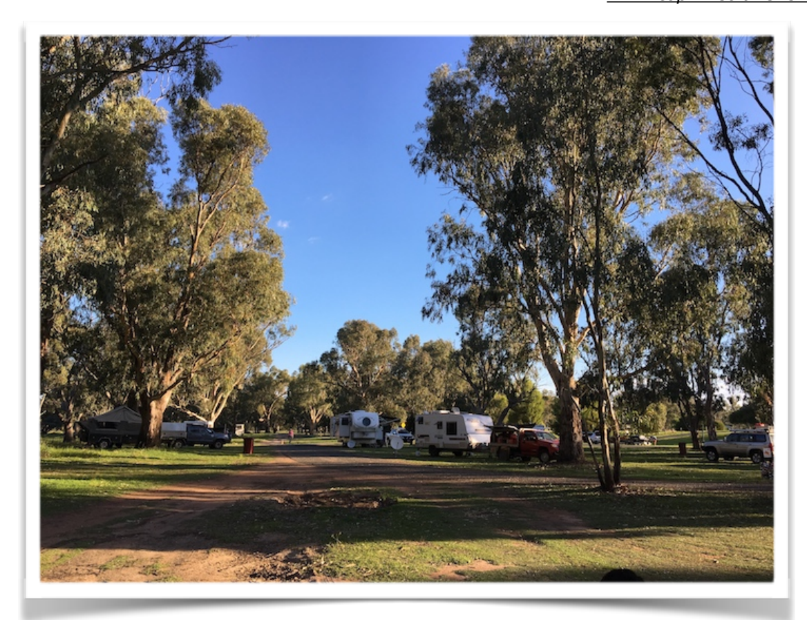
LOTS OF PLACES TO CAMP.