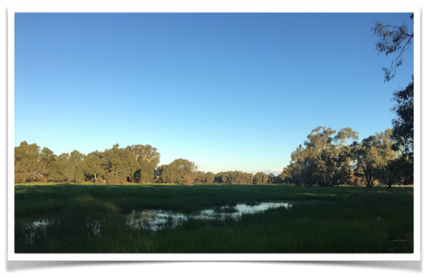
ANOTHER UNLIKELY SWAMP. THE FROGS LOVE IT...