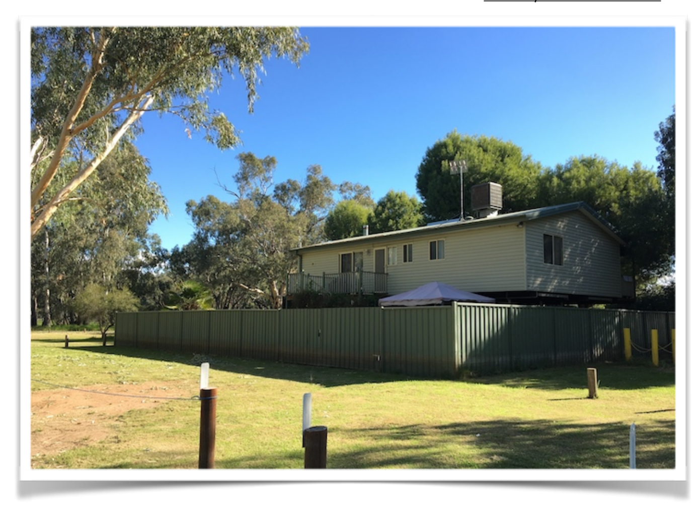
THE BROWN LINE ALONG THE BOTTOM OF THE FENCE IS ABOUT HALF A METRE HIGH - EVIDENCE OF THE RECENT FLOOD.