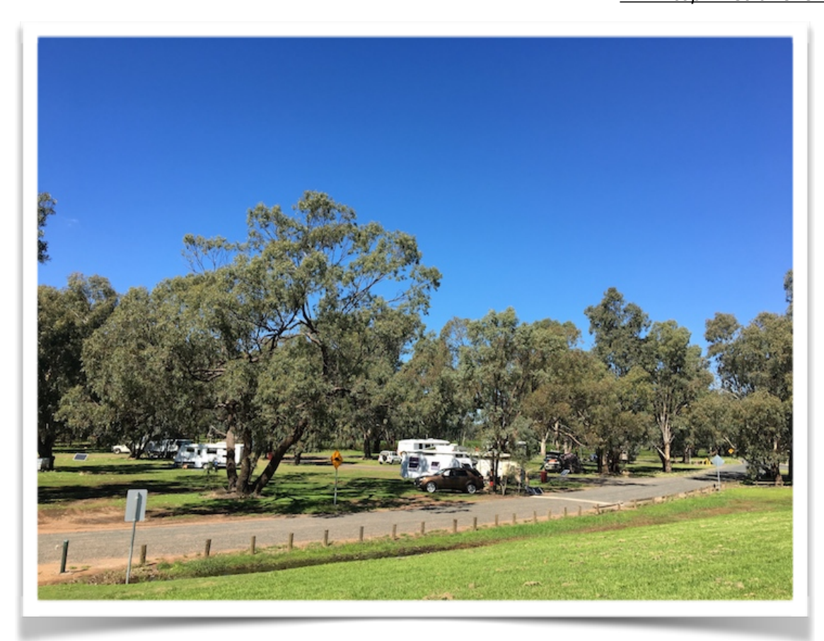
A WIDER VIEW OF THE CAMPGROUND.