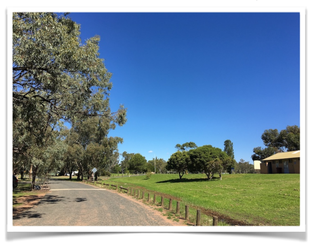
AMENITIES BLOCK ON THE RIGHT.