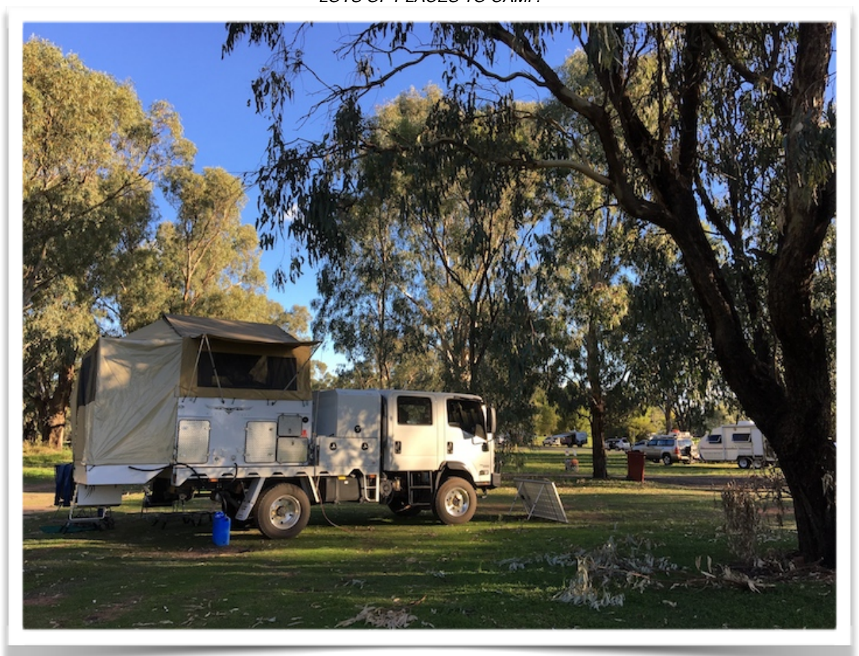
WE FOUND A SHADY SPOT - PERFECT!