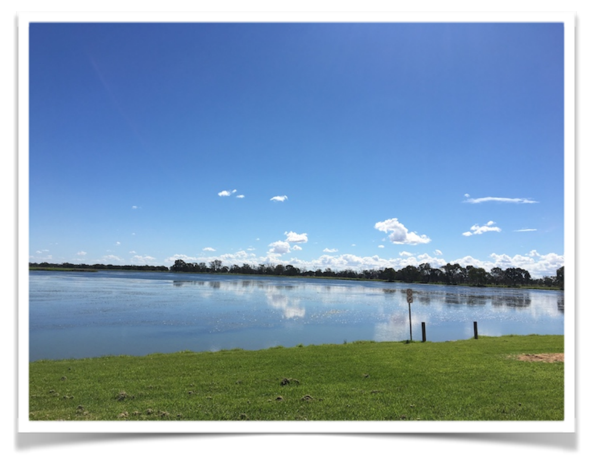
GUM BEND LAKE, AN OASIS IN THE OUTBACK.

You could do worse than to camp at Gum Bend Lake.