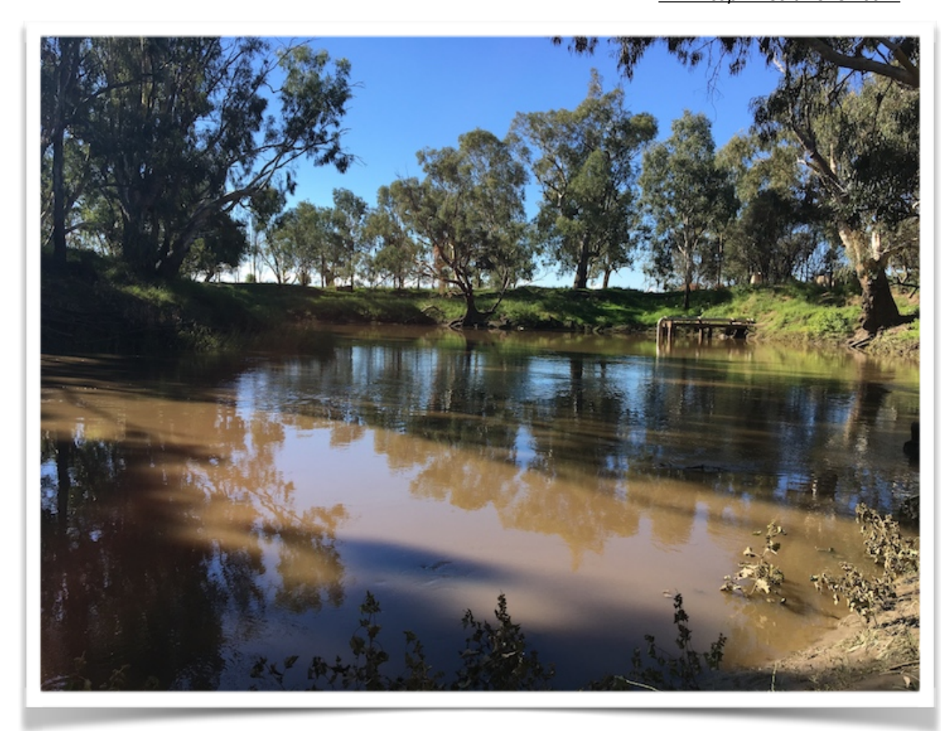
THE PIPE IN THE BACKGROUND IS USED TO PUMP WATER INTO THE MAN-MADE LAKE. LIKE EVERY WATER USER, THEY ARE ALLOCATED WATER RIGHTS.