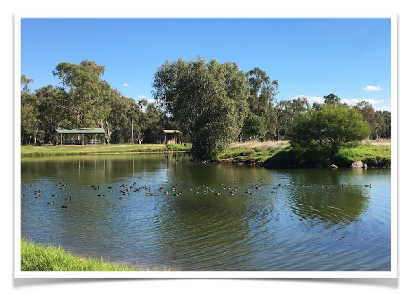
THE BIRDLIFE IS PROLIFIC - WATERFOWL, BLACK SWANS, GALAHS, GEESE, DUCKS AND OF COURSE CORELLAS TO NAME A FEW.

An undercover eating area, free barbecues and an undercover kids playground mean this is truly a family-friendly destination. Perhaps the biggest attraction for locals is the lake. It's large enough to water-ski and wakeboard on.