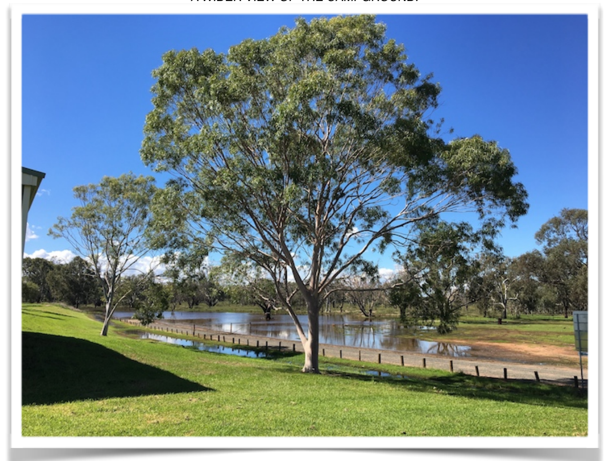
THIS "LAKE" IS SUPPOSED TO BE A CAMPING AREA! LOTS OF RECENT RAIN HAS TURNED IT INTO A SWAMP.