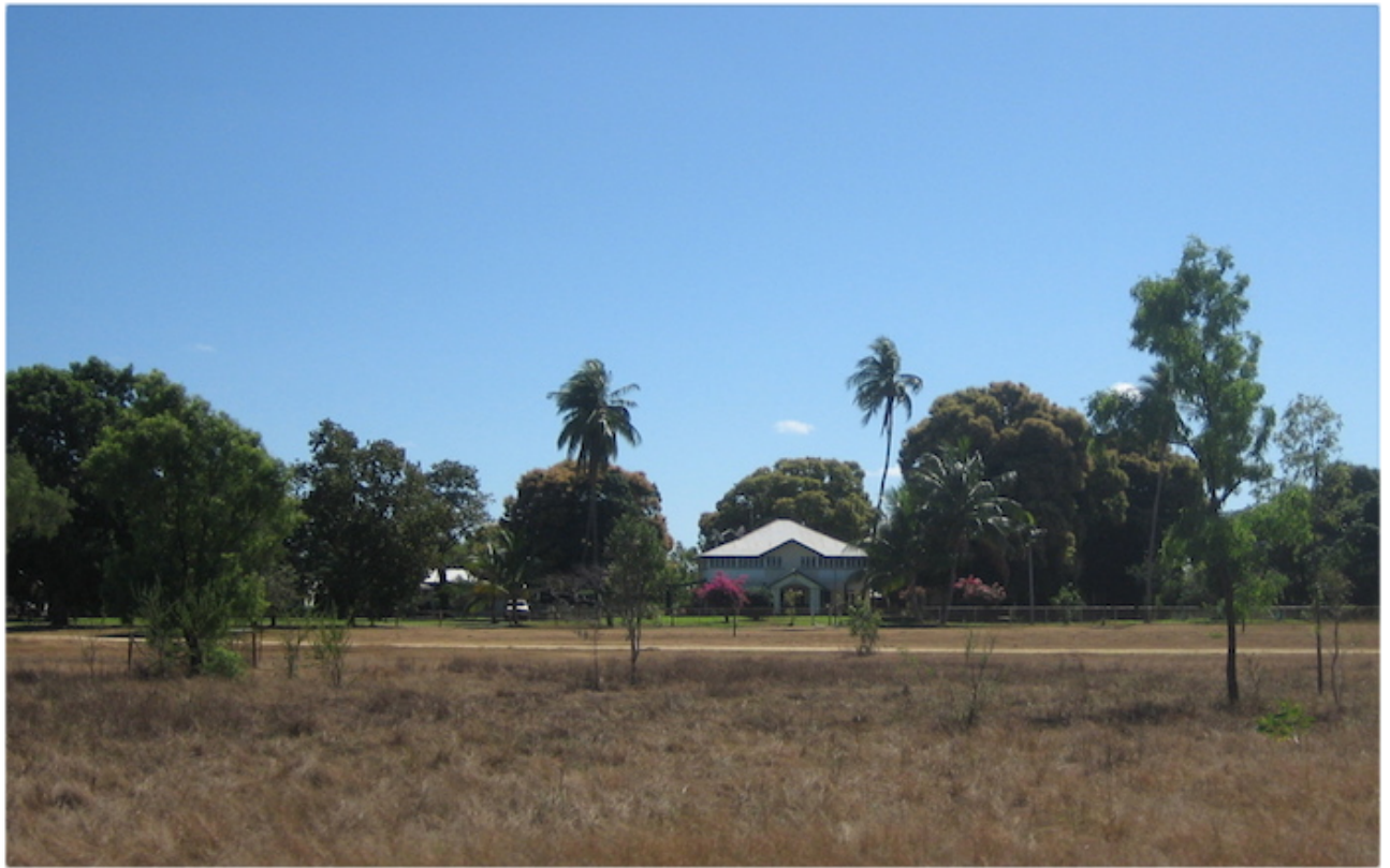
DUNBAR STATION – A CLASSIC QUEENSLANDER.

You'll be travelling in a vague Easterly direction once you pass Dunbar Station. Away in the distance to your left (North) is the Mitchell River. You won't really see the river, but you'll encounter the occasional billabong – offshoots of the river proper.