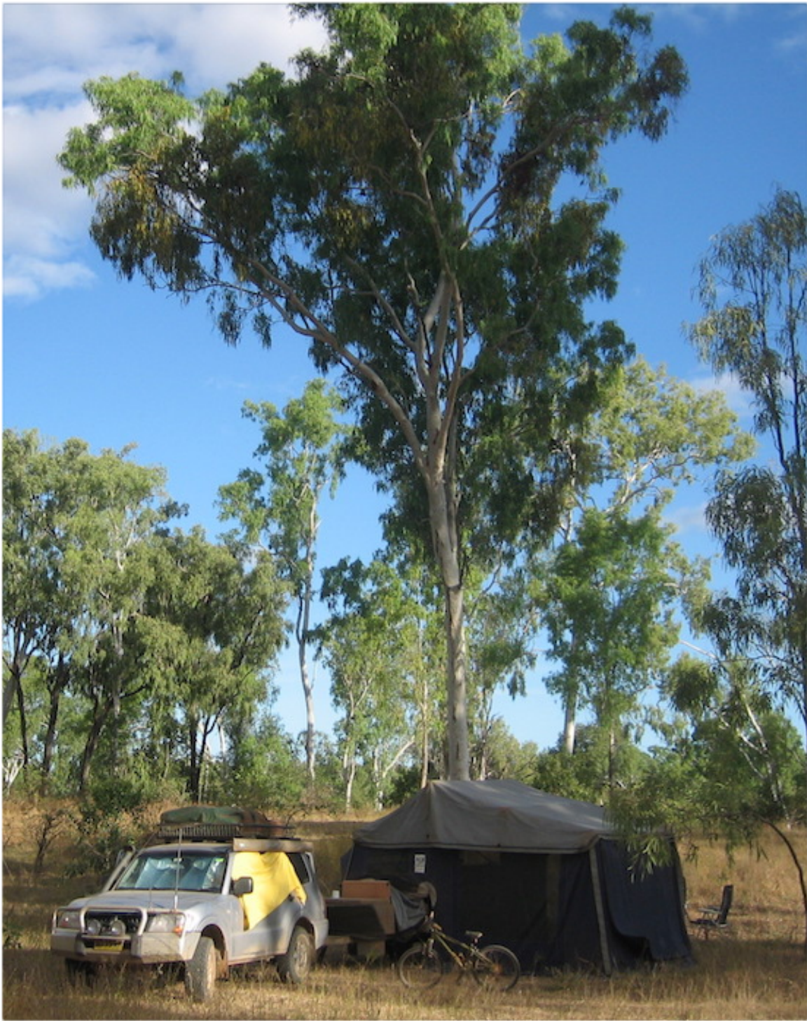
PEACE AND QUIET, THAT'S WHAT IT'S ALL ABOUT.