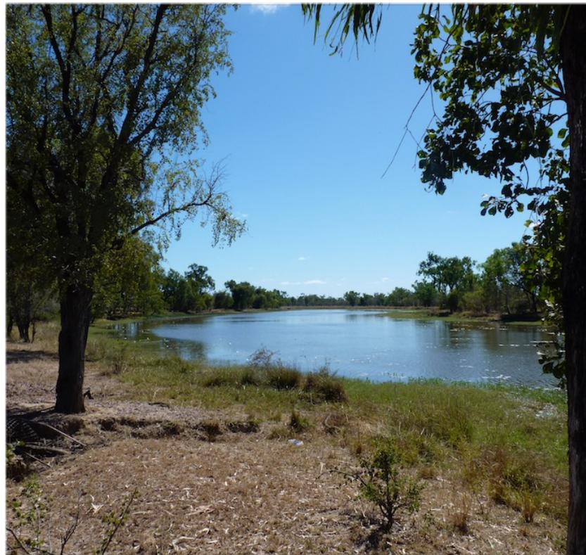
OUR LUNCH STOP – PERFECT!

You'll be travelling in a vague Easterly direction once you pass Dunbar Station. Away in the distance to your left (North) is the Mitchell River. You won't really see the river, but you'll encounter the occasional billabong – offshoots of the river proper.