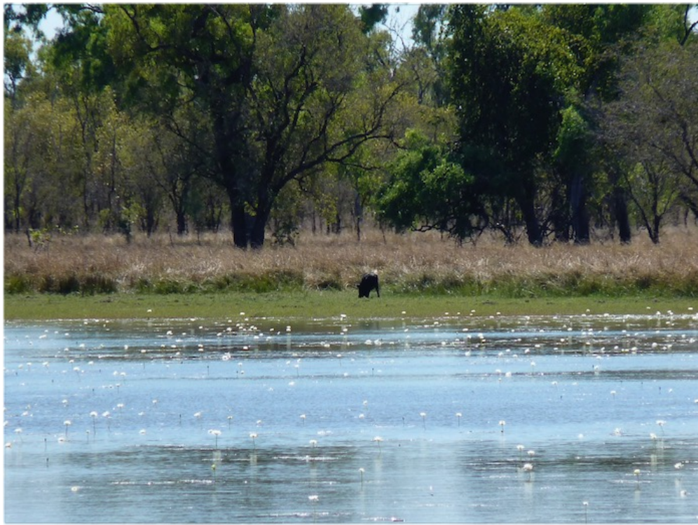
A FERAL PIG ACROSS THE WATER. PIGS DO ENORMOUS DAMAGE TO WATERHOLES LIKE THIS ONE. THEY TEAR UP THE GROUND AND CAUSE EROSION.