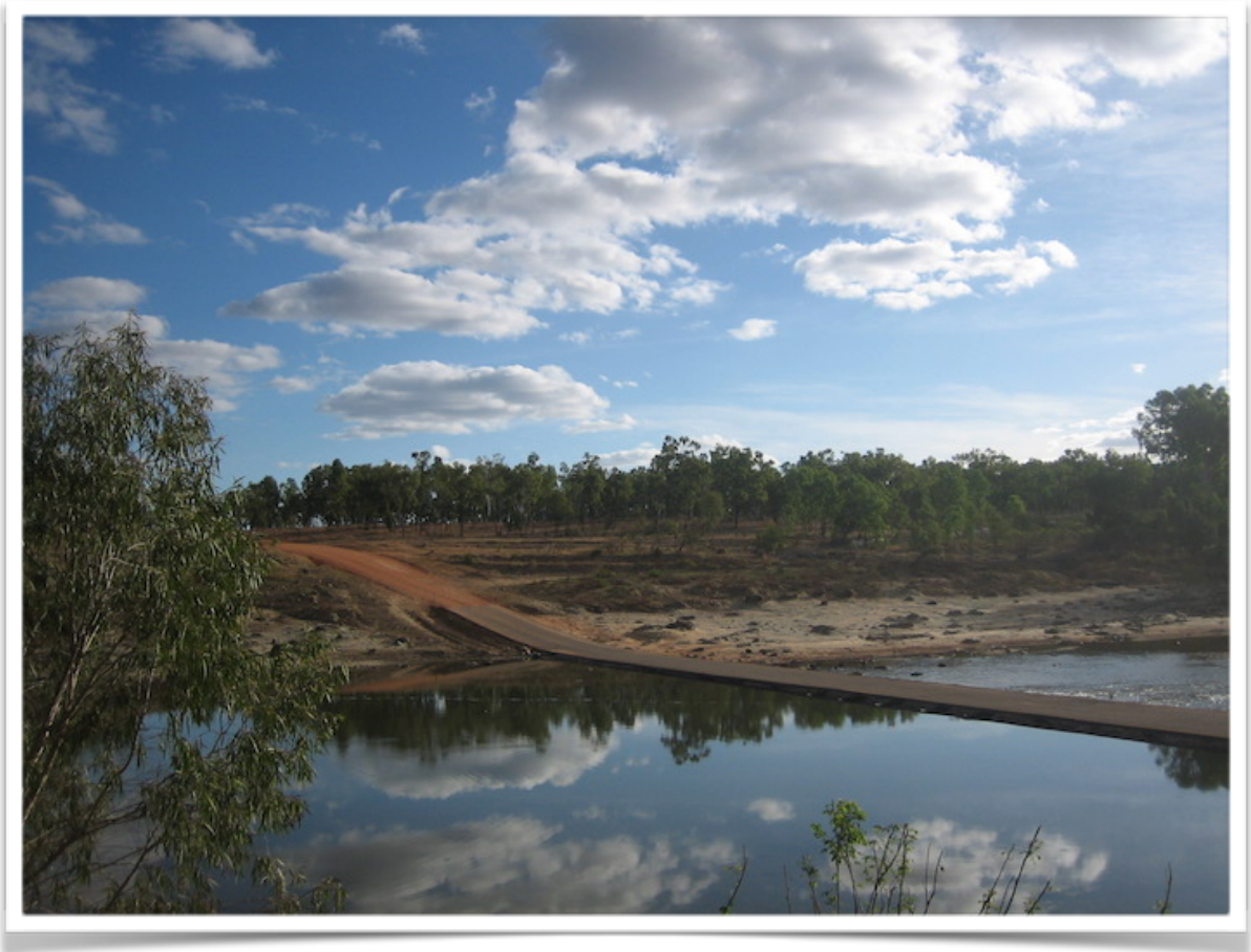
WALSH RIVER CROSSING.

In the morning we awoke to the strange call of blue winged kookaburras. Certainly beats being woken by an alarm clock!