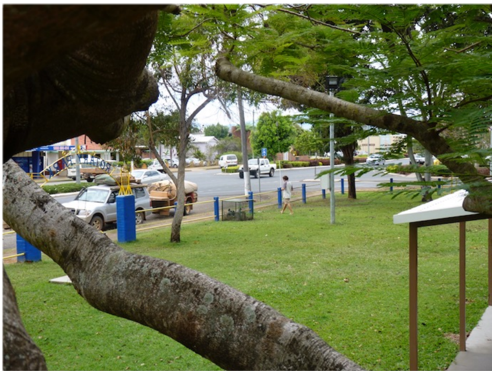
A QUICK BREAK IN A PARK IN MAREEBA, THEN ONWARDS TOWARDS COOKTOWN.