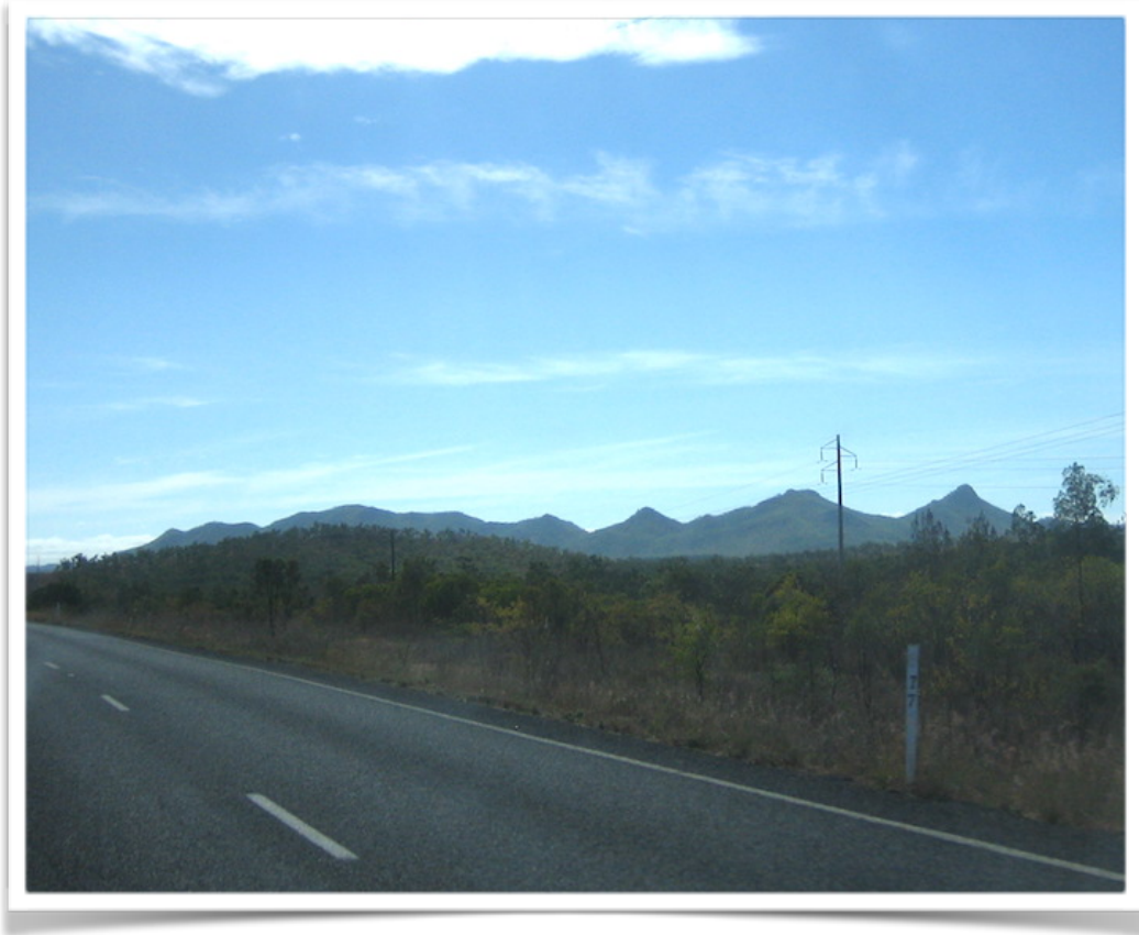
GREAT DIVIDING RANGE IN THE DISTANCE.