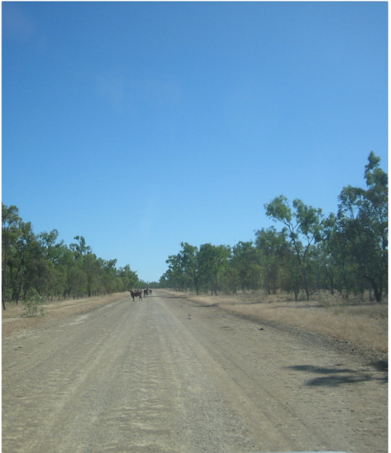
WATCH OUT FOR THE CATTLE ON THE BDR.