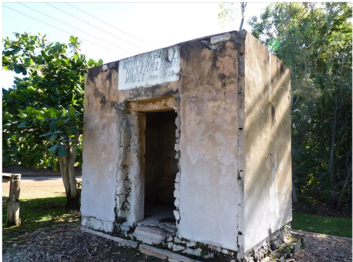
A RATHER SOLID BANK VAULT, CHILLAGOE.

This area is certainly on our list of places to explore further.