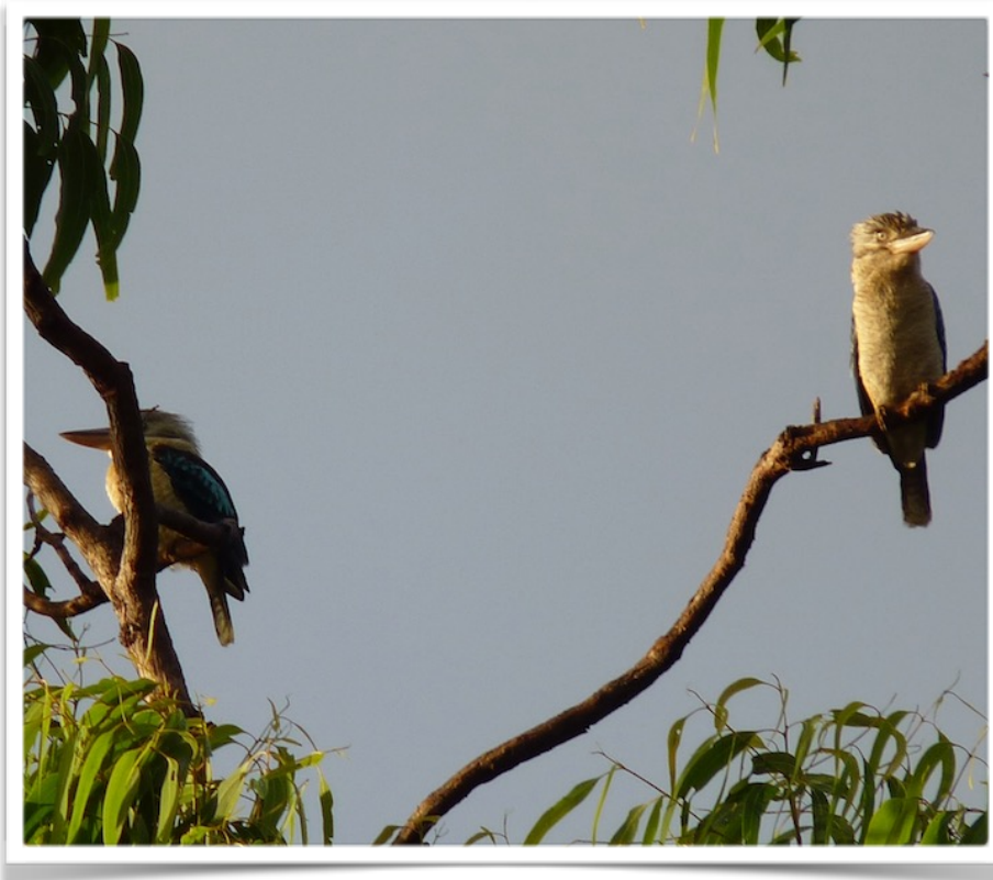
BLUE WINGED KOOKABURRAS (ACTUAL PHOTO WAS TAKEN AT BRAMWELL STATION, CAPE YORK).

In the morning we awoke to the strange call of blue winged kookaburras. Certainly beats being woken by an alarm clock!