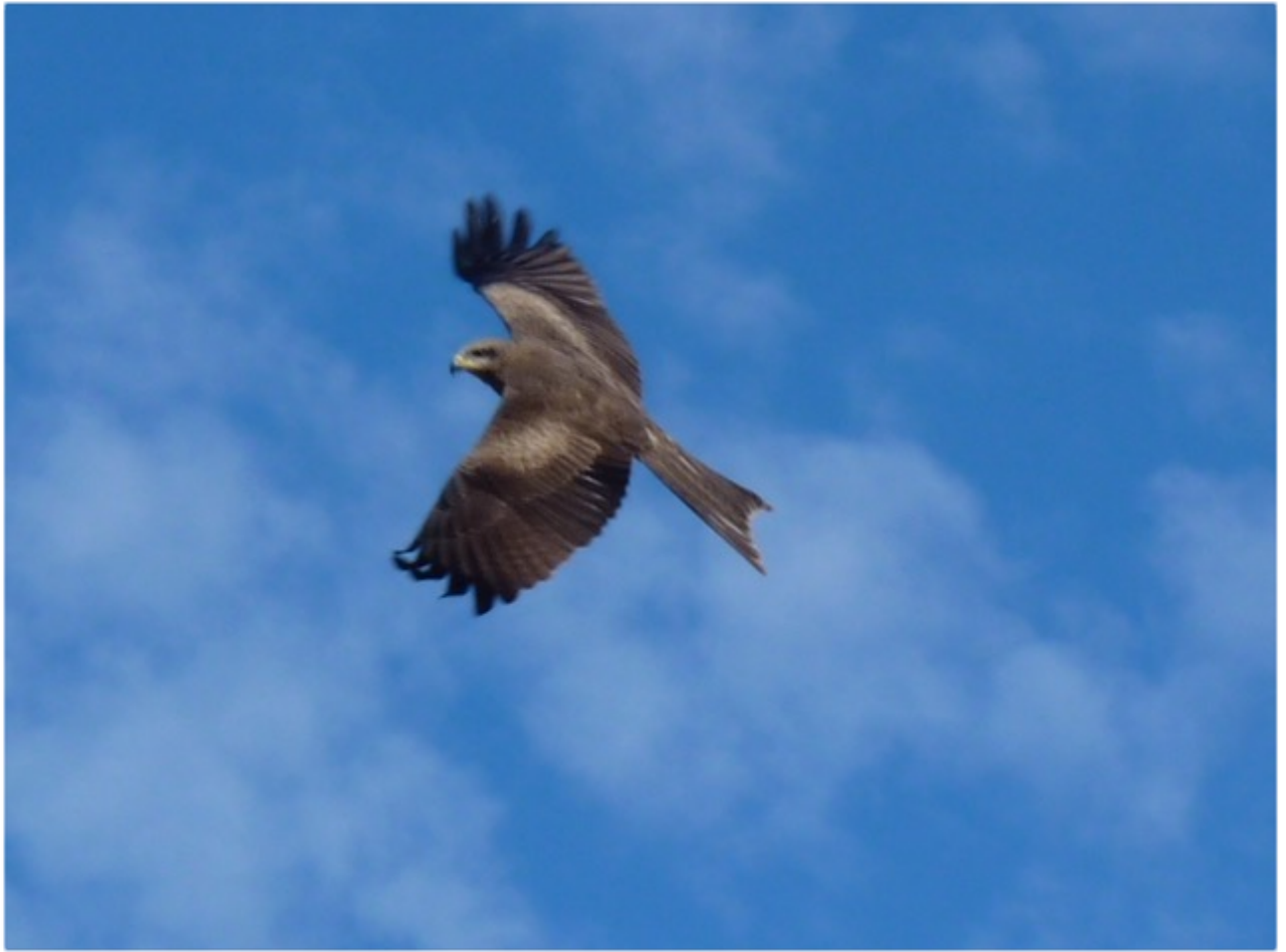
A WATCHFUL HAWK.