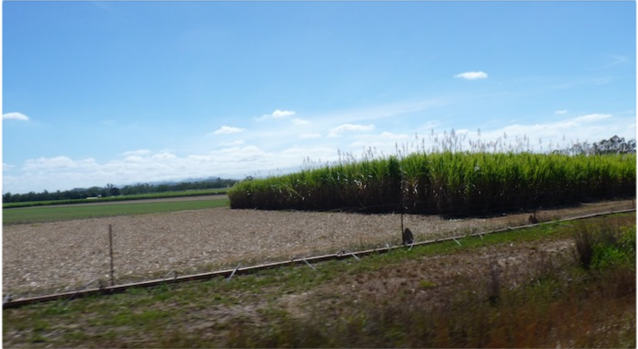
SUGAR CANE CROPS ON THE OUTSKIRTS OF MAREEBA. THE TROPICAL GREENERY WAS A BIT OF A SHOCK AFTER SPENDING SO MUCH TIME IN SAVANNAH COUNTRY.

We had planned to stop in Mareeba for a few days. However, the place was full of travellers and tourists. All the caravan parks were full. Our only alternative was the local show ground, which didn't appeal.