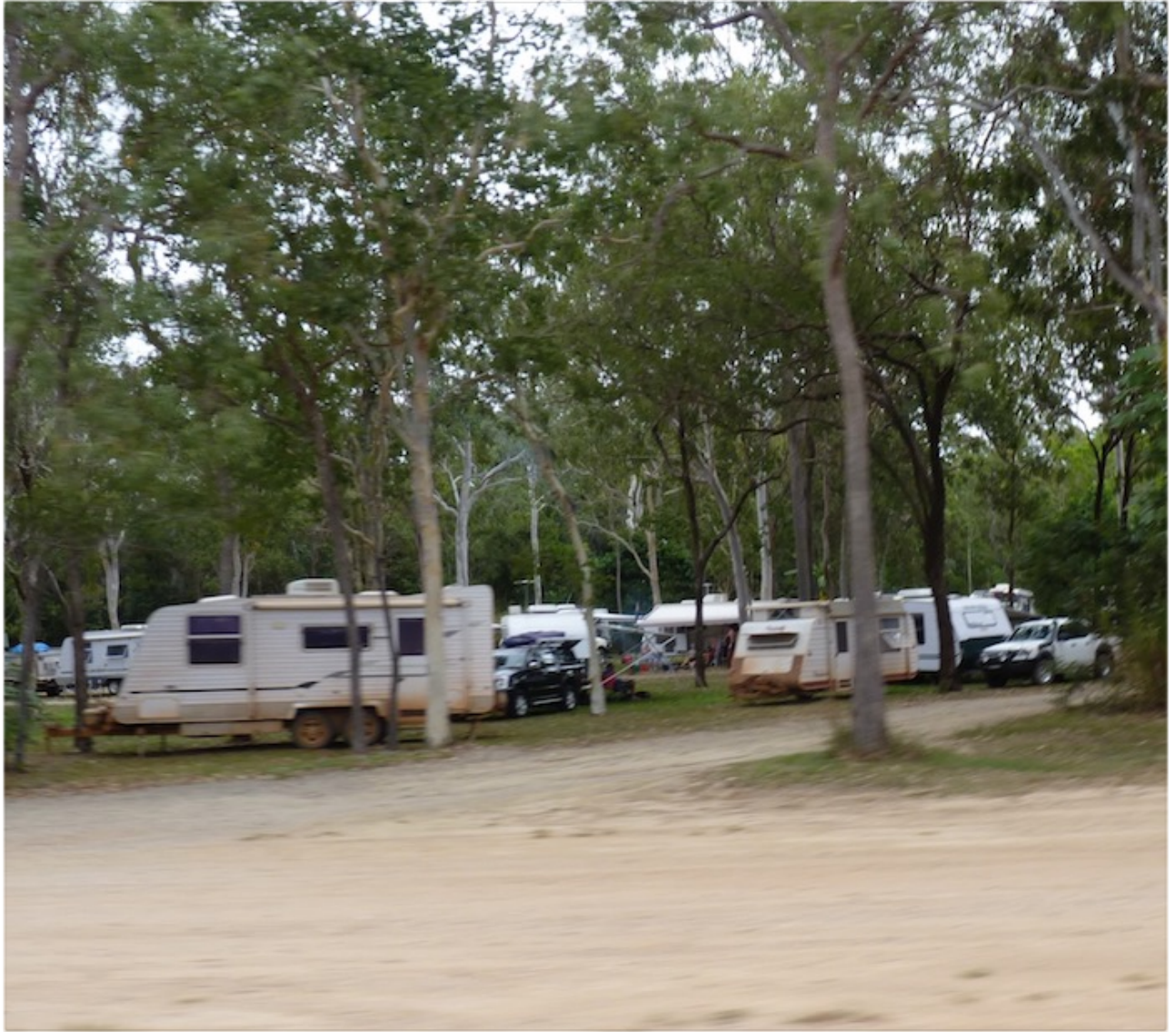
BELIEVE IT OR NOT THIS ISN'T A CARAVAN PARK – IT'S A REST AREA! BETWEEN MAREEBA AND COOKTOWN.