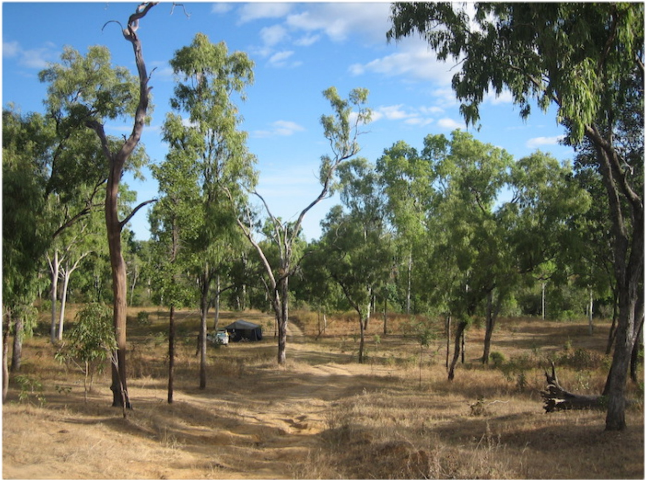
OUR CAMPSITE AT WALSH RIVER CROSSING.