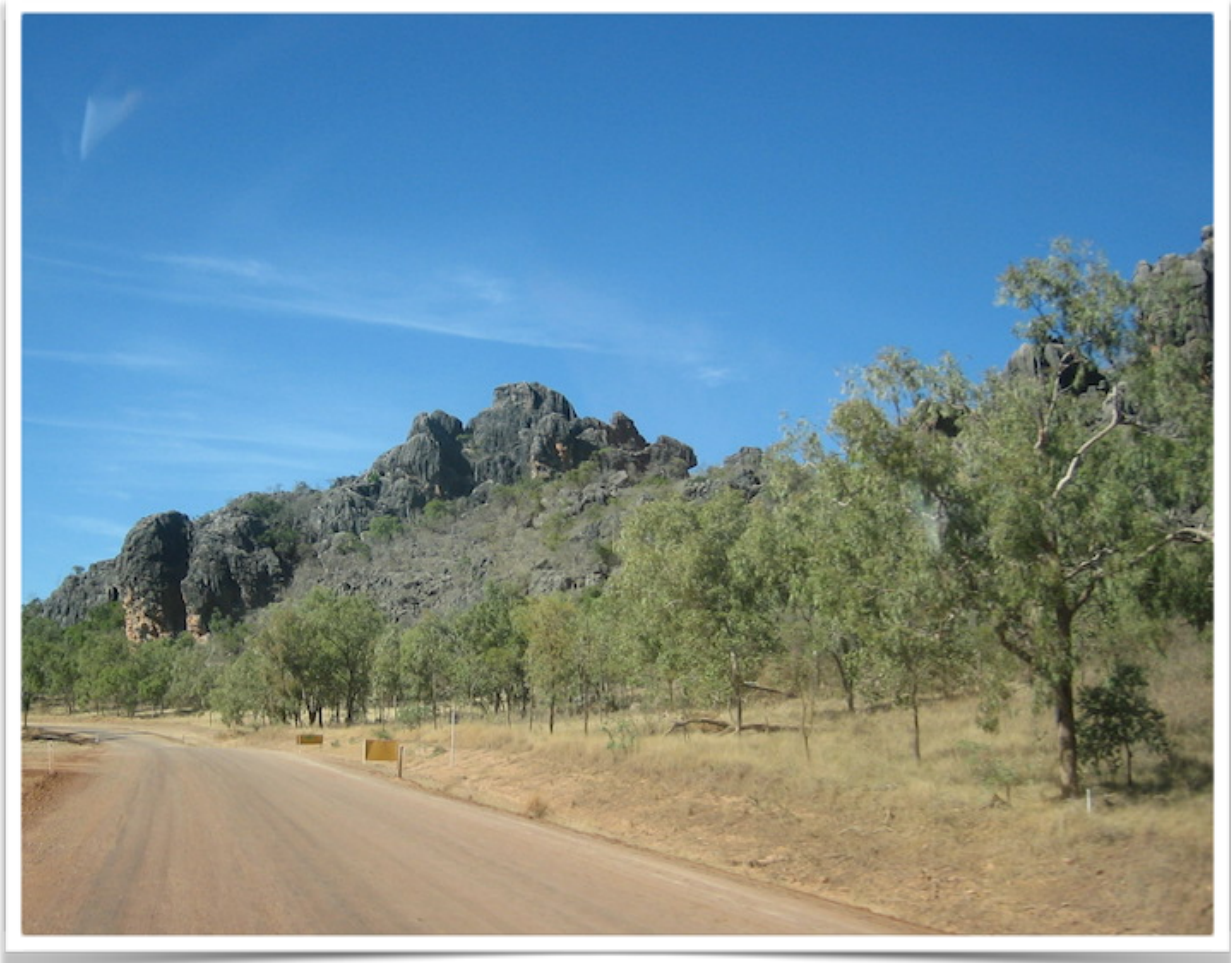
UNUSUAL ROCK OUTCROPS CLOSE TO CHILLAGOE.