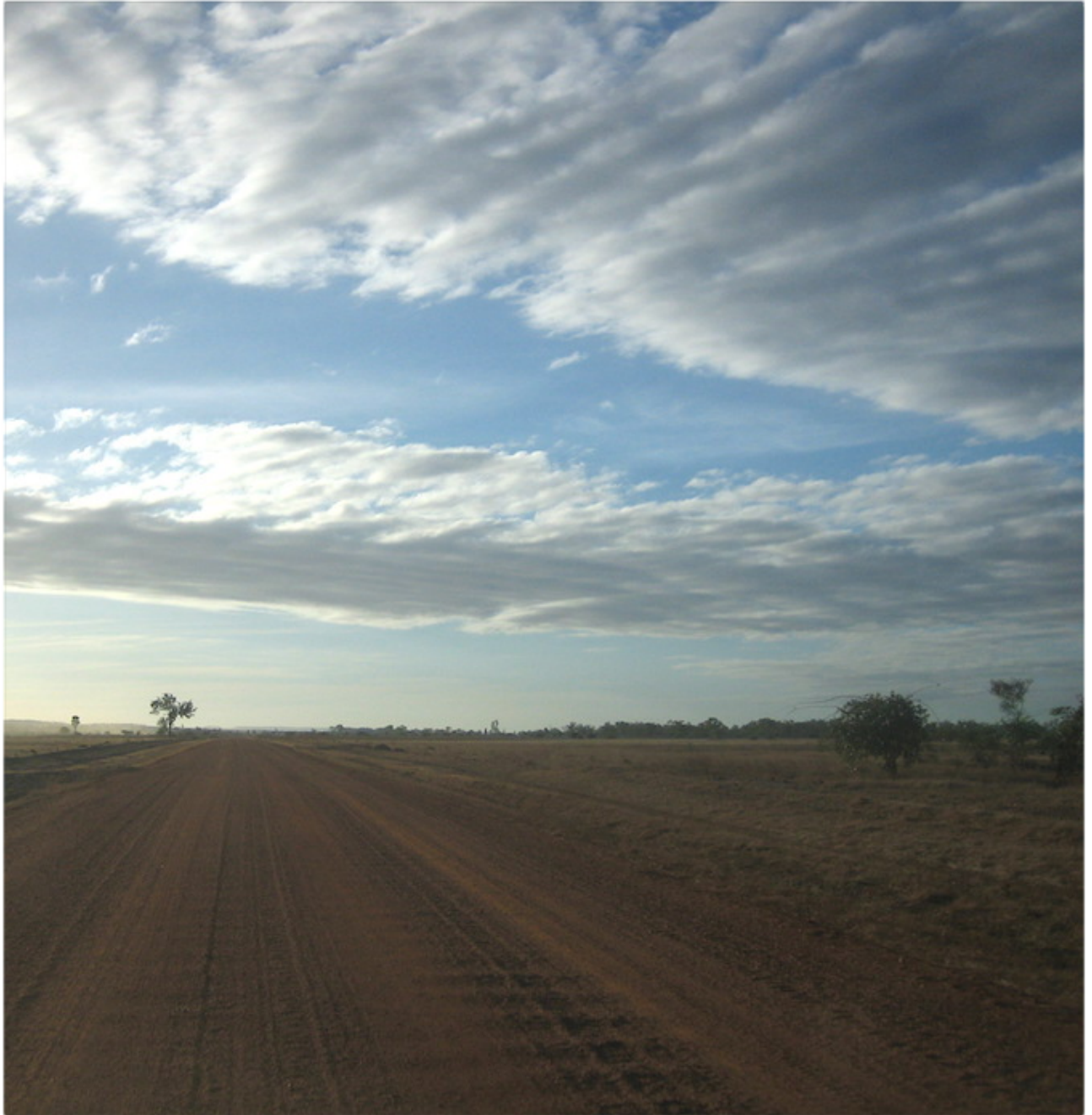
HEADING EAST IN THE EARLY MORNING SUN.

Pushing further East on the Burke Developmental Road, we eventually started to see mountains on the horizon. The Great Dividing Range was looming in the distance! Strange black rock outcrops and some “real” hills signalled Chillagoe was close.